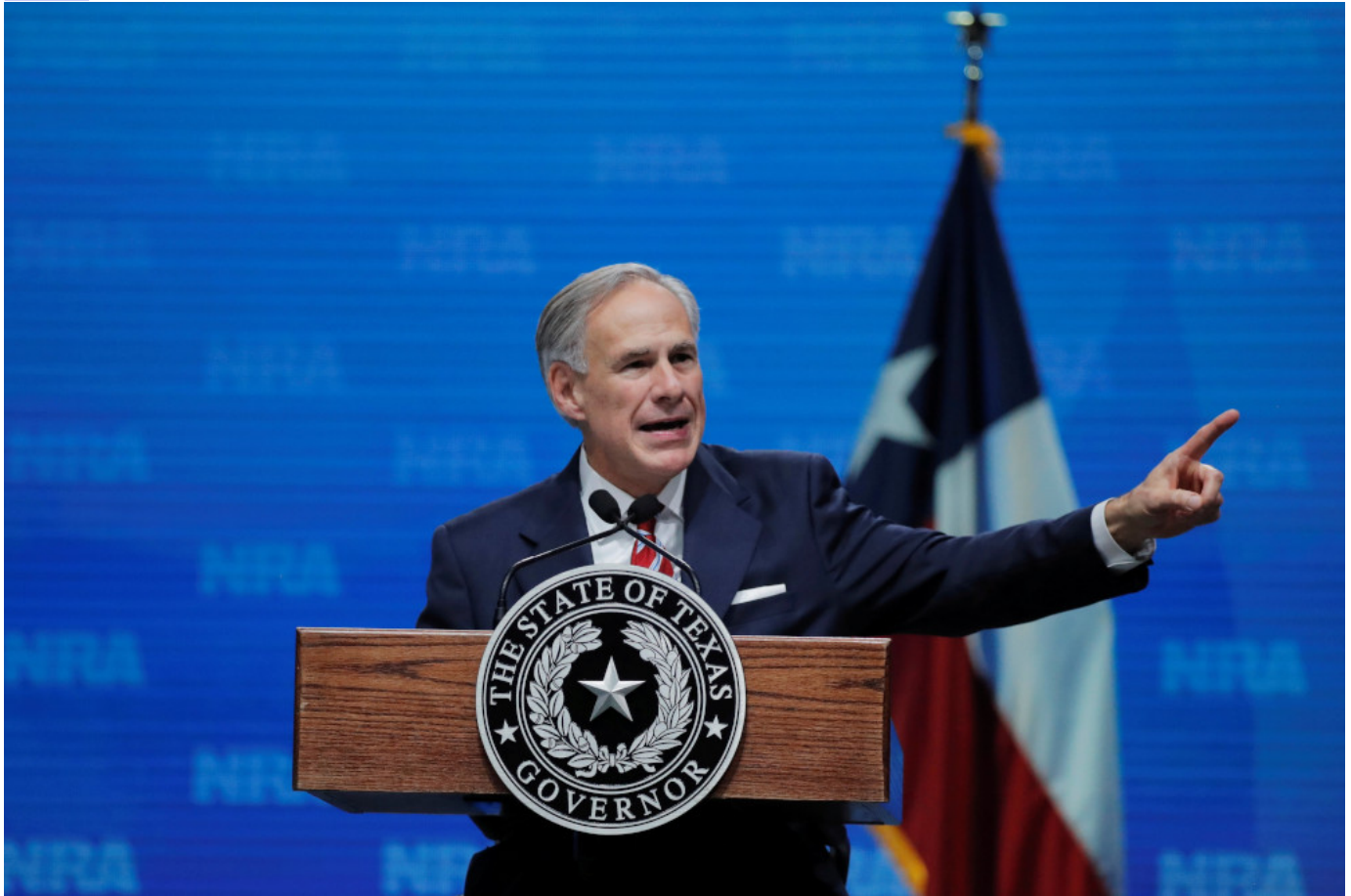
Texas Gov. Greg Abbott is seen in this 2018 file photo.