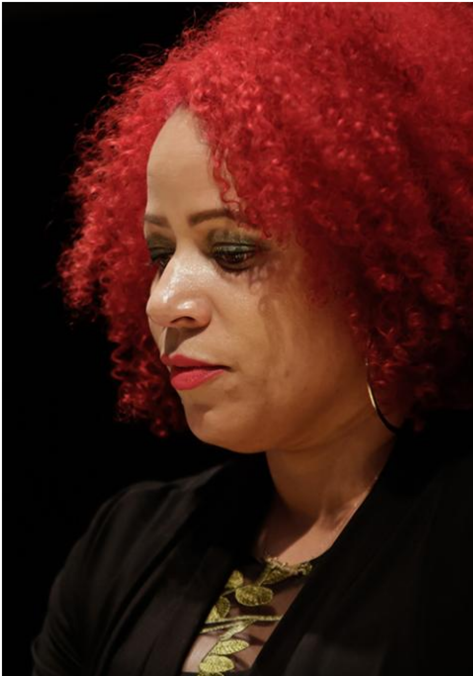
Nikole Hannah-Jones in 2018

The history of a person, and even more of a nation, is like a large river. There may be many tributaries. As the historiography of an era develops, new tributaries are discovered, especially in the case of populations that did not leave extensive written documentary evidence of their thoughts and deeds, such as slaves in the British North American colonies and young United States. If the goal of "The 1619 Project" was merely to point to the need for more attention on the many and varied