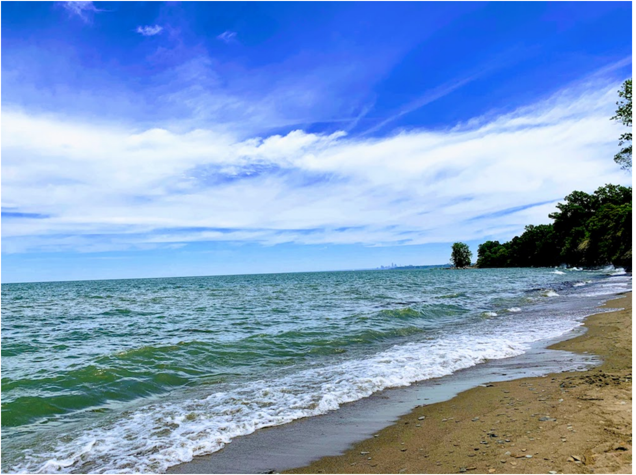
The once-clear waters along Lake Erie's shores are threatened by periodic toxic algae blooms. (Christina Randazzo)