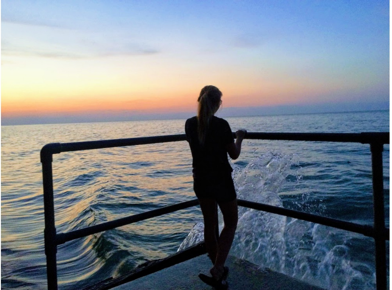
Sunset over Lake Erie, where the author's passion for sustainability was born.

When I was little, Lake Erie and I would play together for hours on end. I would launch myself from her strong, rocky spine into her bright blue embrace and listen to the stories she would whisper through her waves. When I was there, I knew I was home.