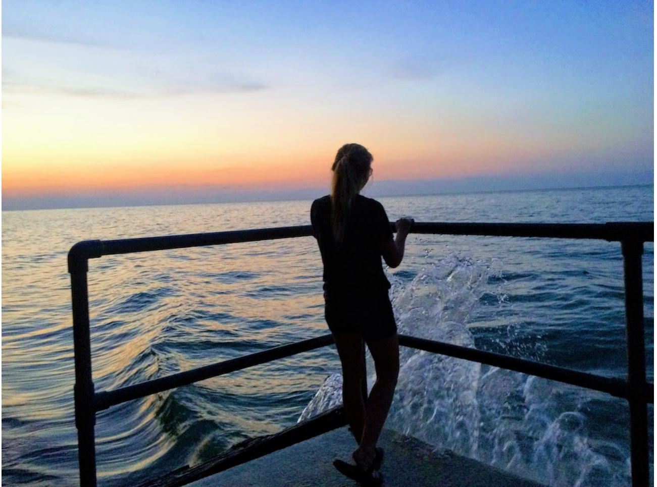
Sunset over Lake Erie, where the author's passion for sustainability was born.

When I was little, Lake Erie and I would play together for hours on end. I would launch myself from her strong, rocky spine into her bright blue embrace and listen to the stories she would whisper through her waves. When I was there, I knew I was home.