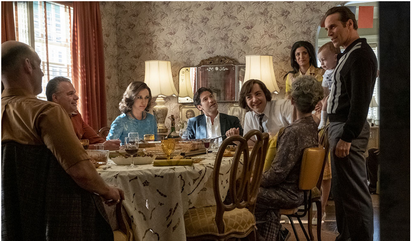
A scene from the movie "The Many Saints of Newark"

Chase, who is Italian and was raised in a Baptist family, didn't have a great experience at the Baptist school his parents sent him to.