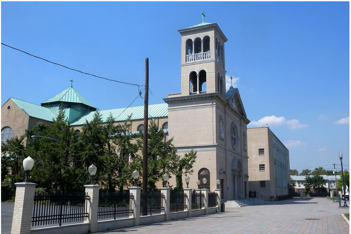
St. Lucy's Church in Newark, New Jersey