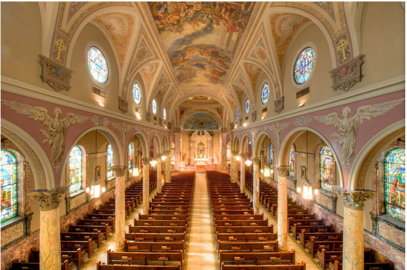
The interior of St. Lucy's Church in Newark, New Jersey

Amid all of this adversity, especially once the Great Depression struck, St. Lucy's was a sanctuary.