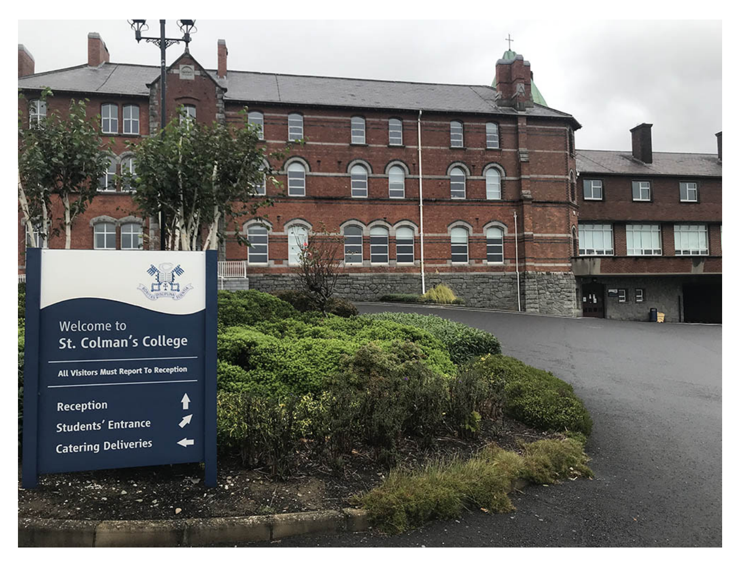
St. Colman's College in Newry, Northern Ireland (Claude Colart)

When the diocese settled a case in favor of a former St. Colman's pupil in 2017, the college <u>condemned the abuse</u> and said it had removed from display all photographs of Finegan.