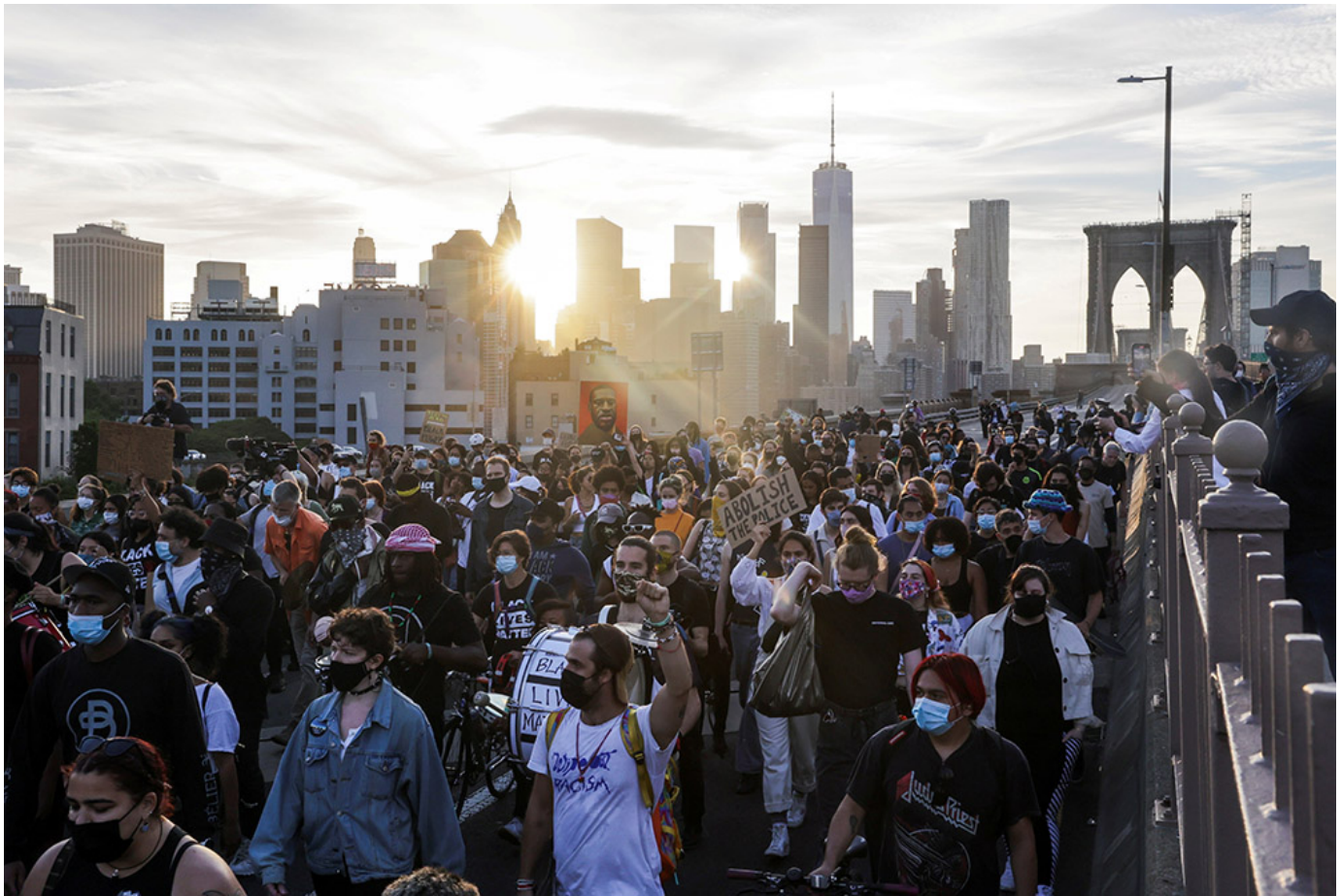
People in New York City march on the Brooklyn Bridge during a demonstration May 25, 2021, on the first anniversary of the death of George Floyd.