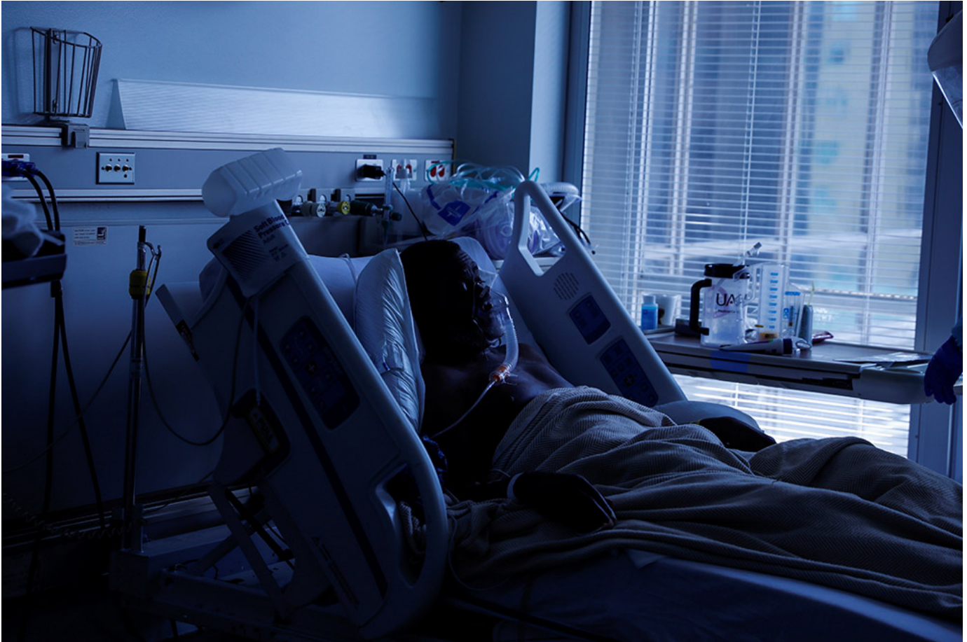
A COVID-19 patient in Little Rock, Arkansas, lays in his isolation room in the COVID-19 unit Aug. 16 at the University of Arkansas for Medical Sciences.

COVID-19 challenge. The central dynamic in that story is the tension that Trump created between the federal government and the states. By steadfastly resisting any coordinated national response to the pandemic he pitted states against each other in their efforts to obtain equipment and medical devices necessary to respond to the health crisis.