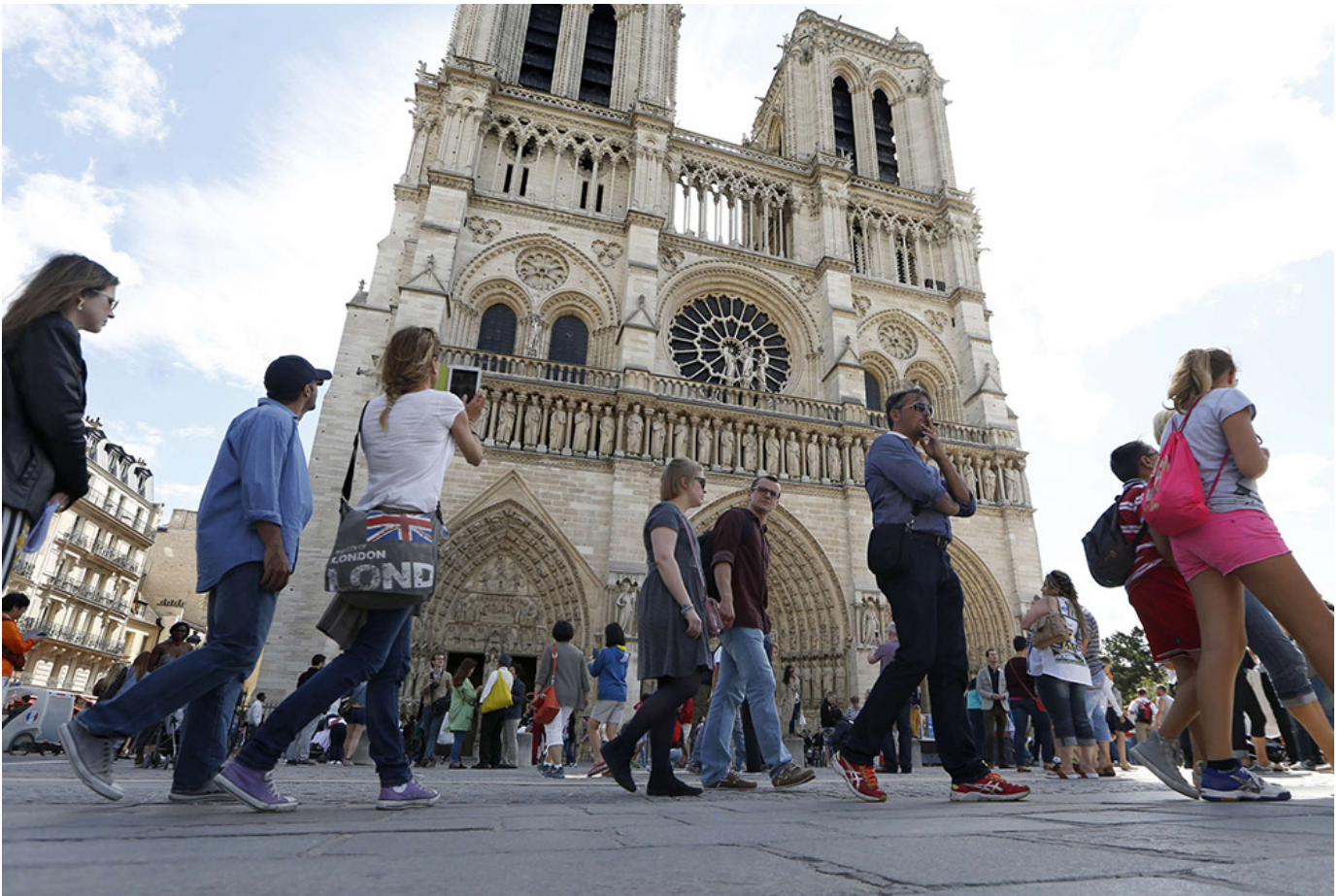
People stand in line outside Notre Dame Cathedral Aug. 22, 2014, in Paris.

The last person in line, a young woman, moved forward slowly and extended her hands. The priest exchanged some words with her, covered the ciborium with the palm of his hand and slightly shook his head, turning his back to return to the altar. The shock of it was as if he had slapped her. The woman, with head down and tears streaming, quickly walked past me.