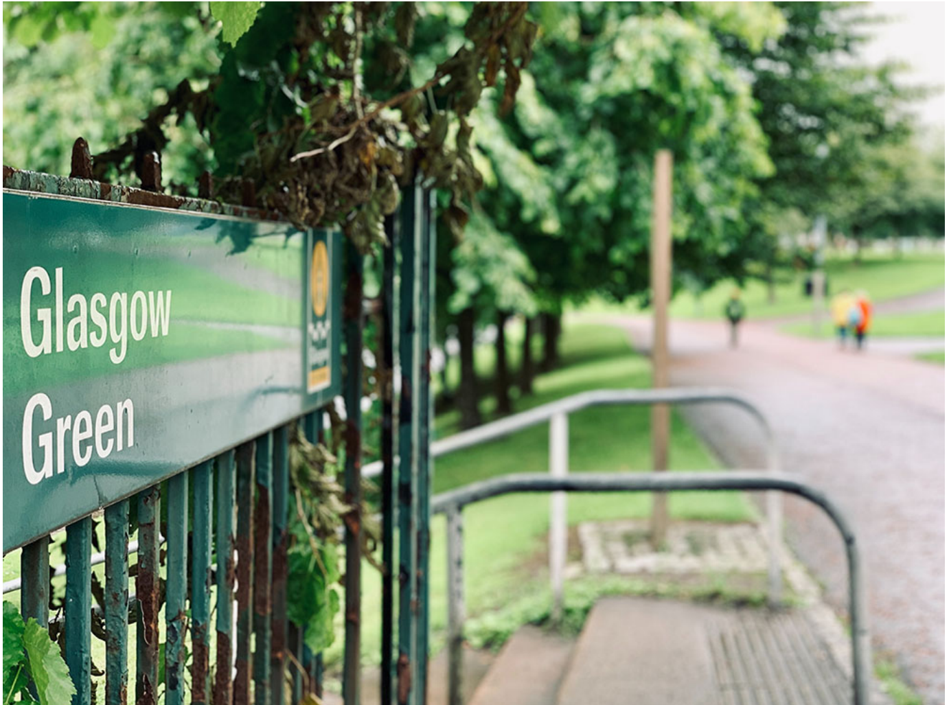
Glasgow Green at the Kings Bridge entrance to the park in Glasgow, Scotland. The city is hosting the United Nations climate conference known as COP26 on Oct. 31-Nov. 12.