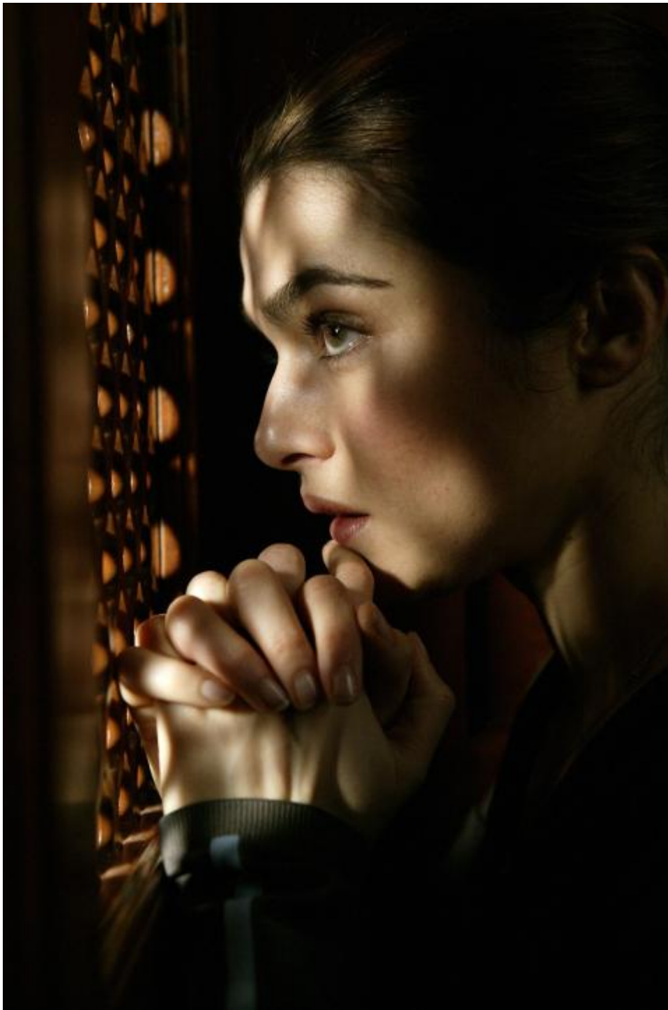
Rachel Weisz in a scene from the 2005 movie "Constantine"