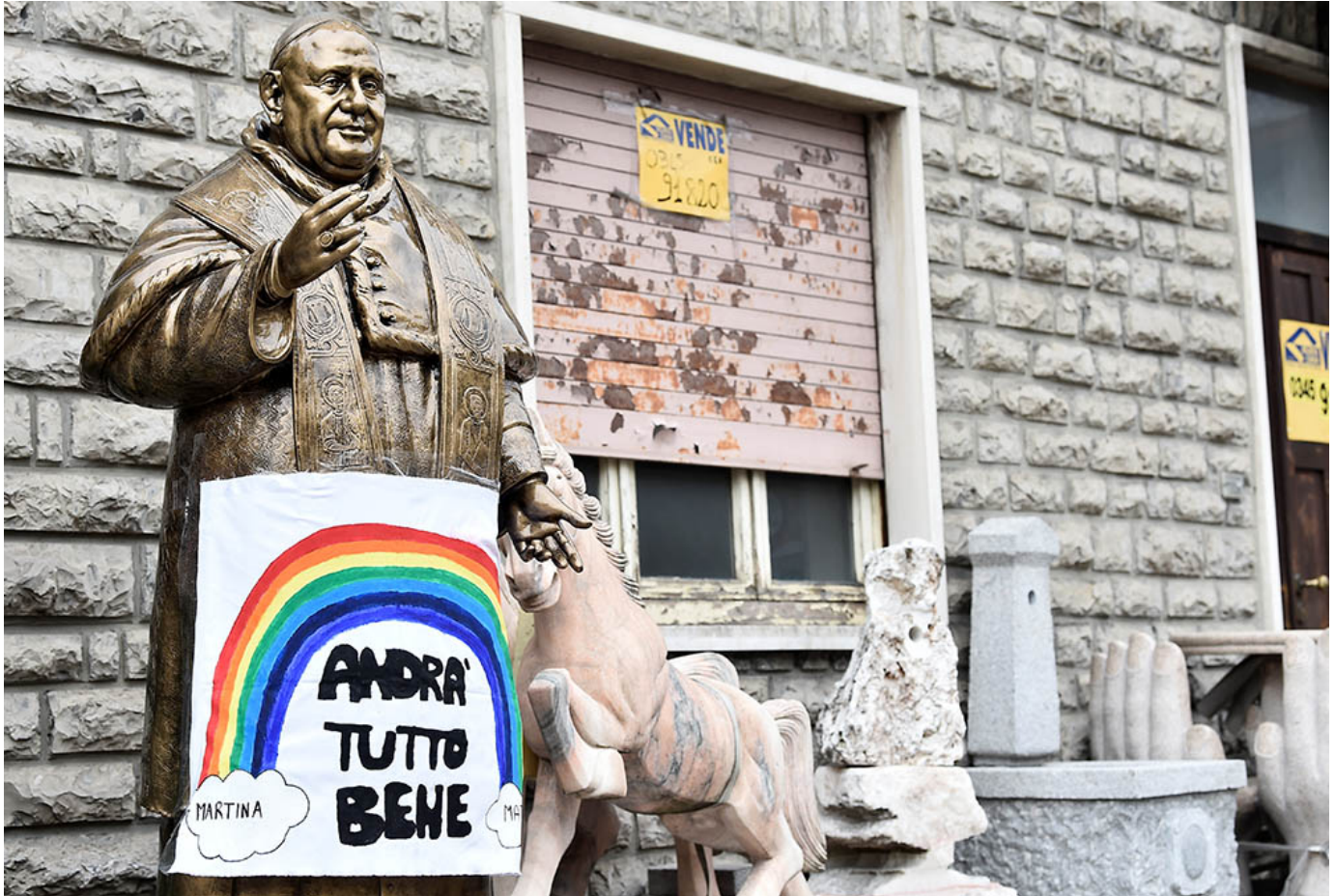
A sign reading "All will be well" hangs on a statue of St. Pope John XXIII in Zogno, Italy, near Bergamo, March 22, 2020.

Opinion News Spirituality Vatican NCR Voices