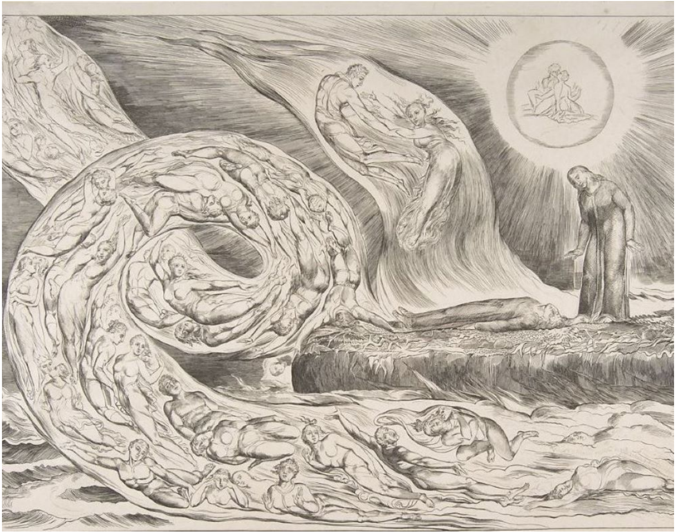
"The Circle of the Lustful: Paolo and Francesca," engraving by William Blake, ca. 1825-27

As with many medieval believers, Dante was heavily influenced by St. Augustine, but his art was hardly the product of monastic-mystical contemplation or Marian visitation. Instead, he was your classic frustrated male poet walking the edge of creepiness with a million chips on his shoulder and an obsession with Beatrice, a local girl he barely knew.