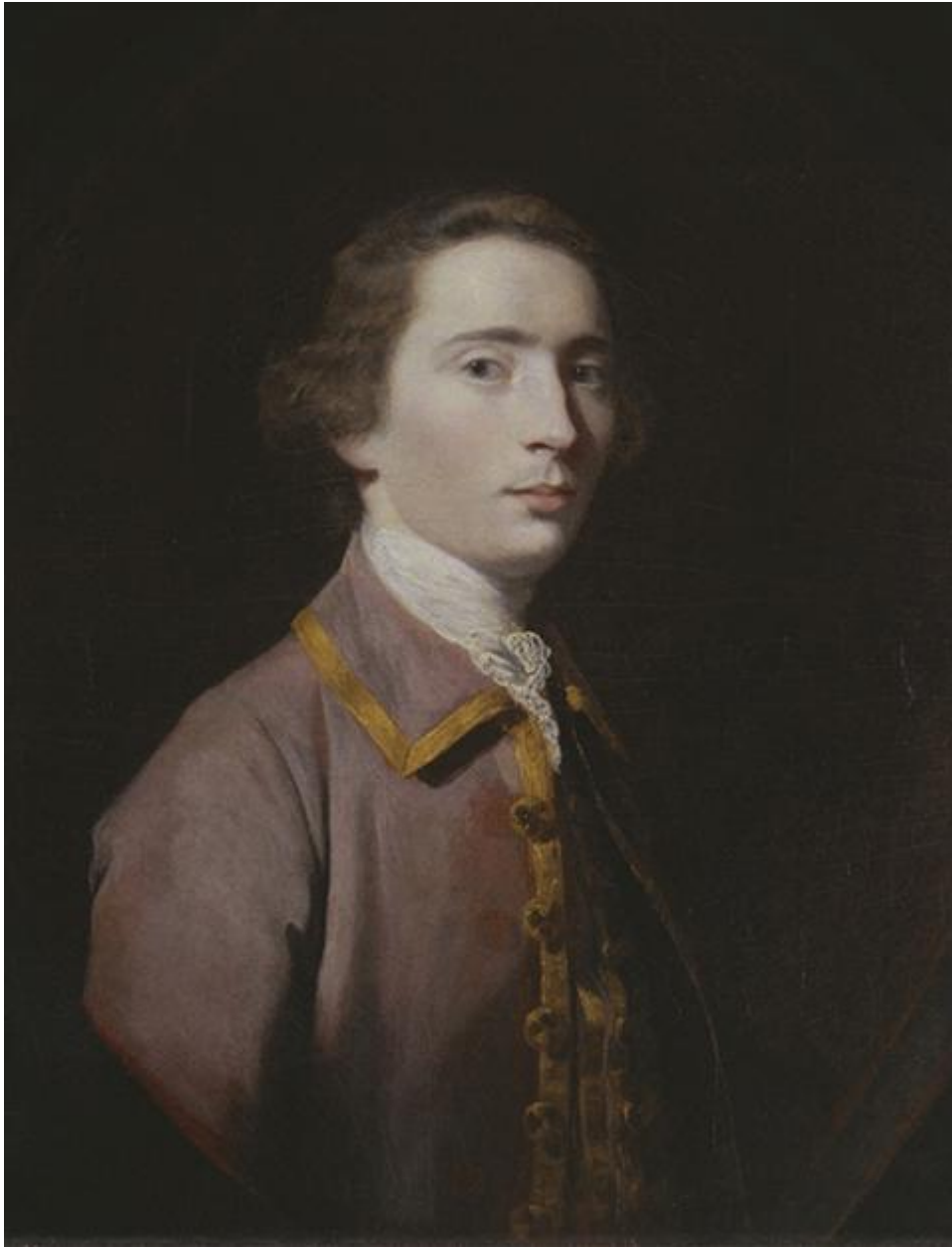
A 1763 portrait of Charles Carroll, who would become the only Catholic signer of the Declaration of Independence (Yale Center for British Art)

It was the unique, pluralistic, revolutionary and opportunistic circumstances that confronted the Founding Fathers that proved decisive. They trusted Catholics like Charles and John Carroll because they had proven themselves trustworthy, because they were "gentlemen" like themselves, men of means and of learning. Non-sectarianism, if not actual secularism, had become a fact of life in the Continental Army as well as the Continental Congress.