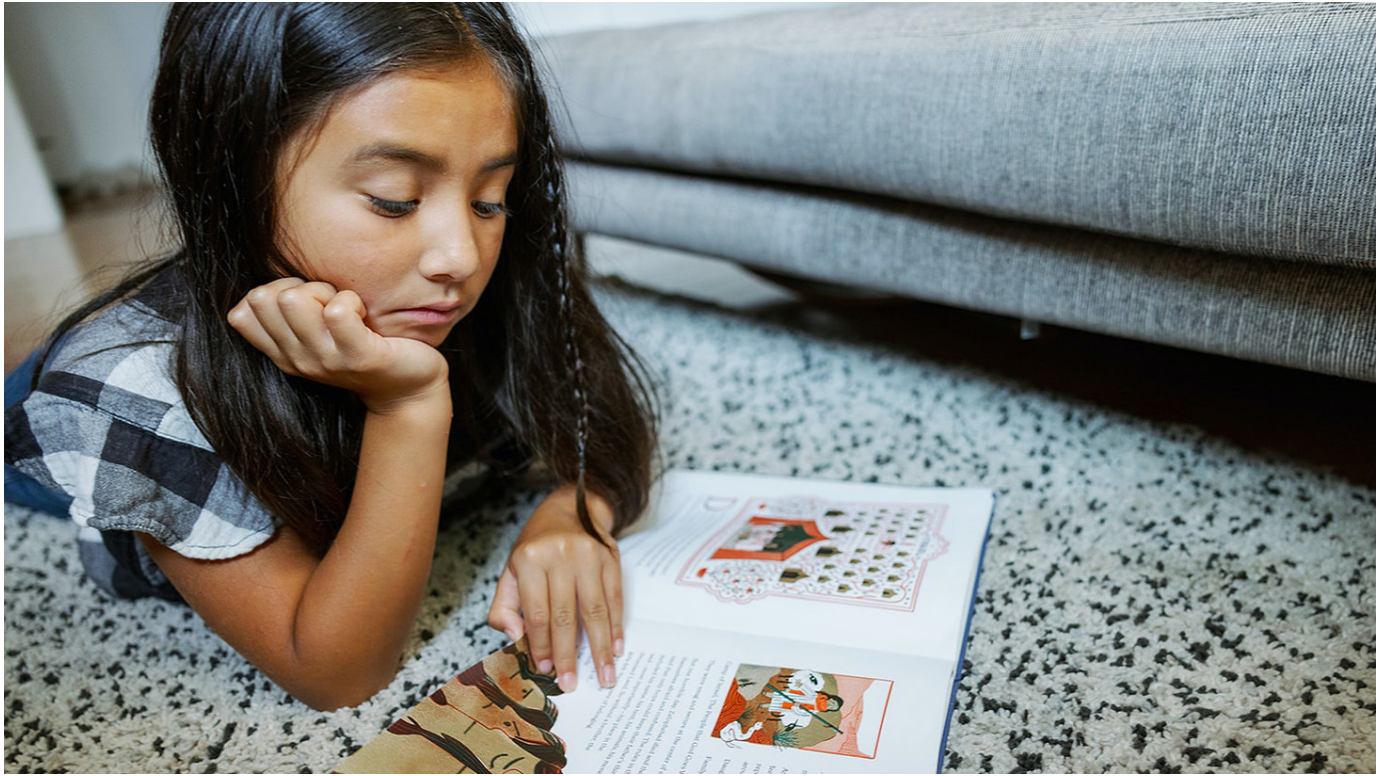
A child reads a sample of "The Book of Belonging."