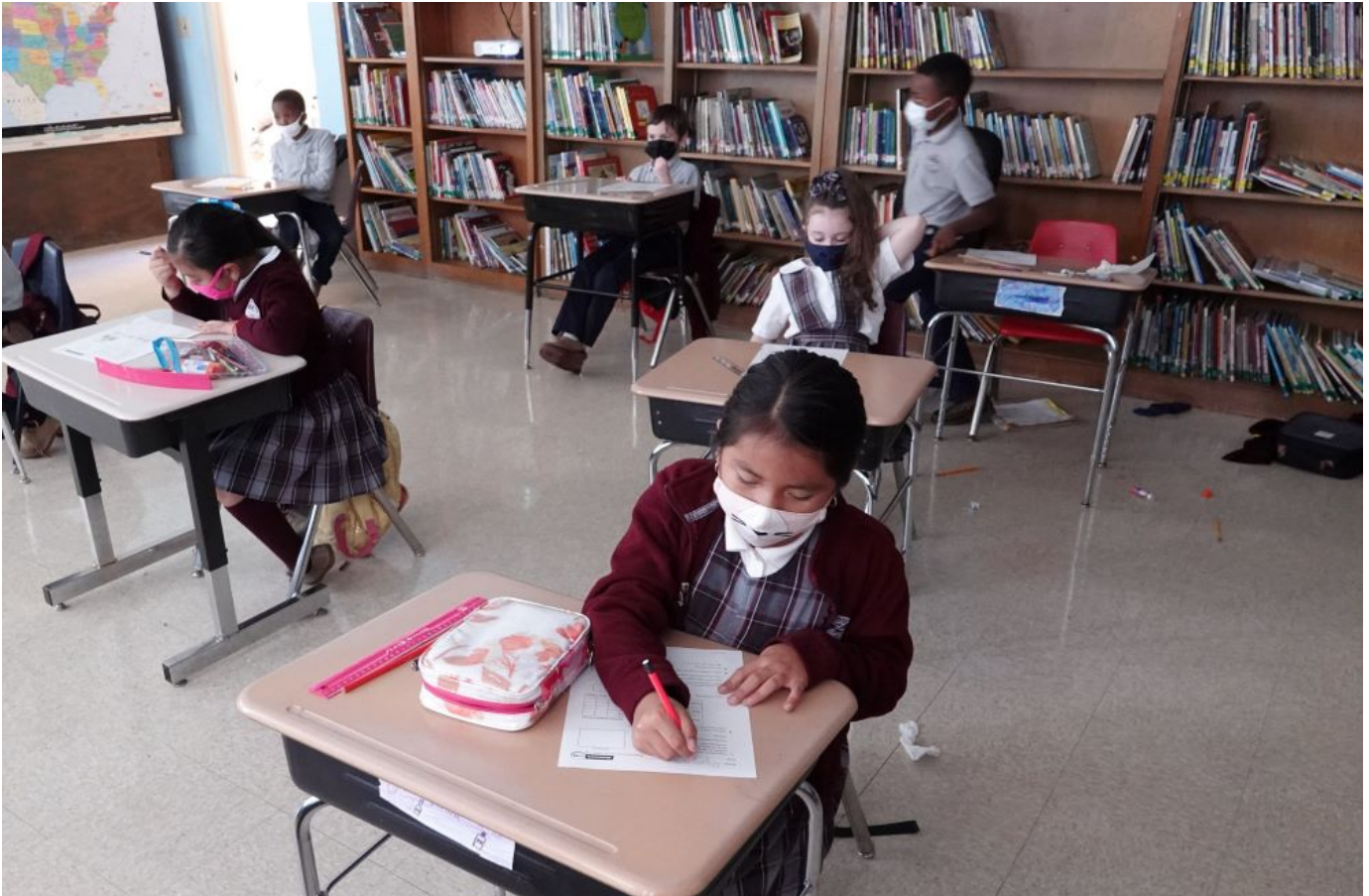
Students at St. Paul Catholic School in Memphis, Tenn., in May