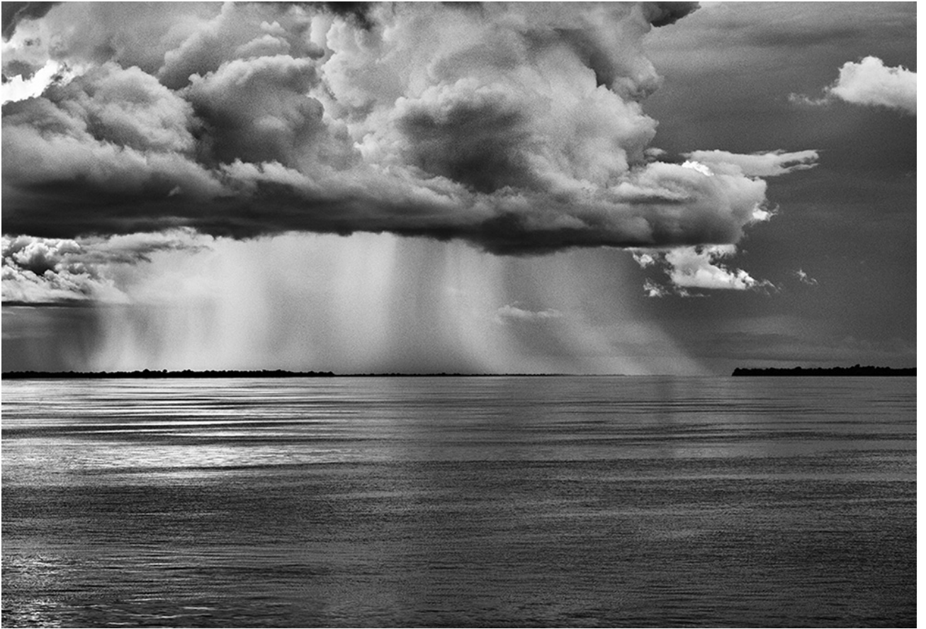
Rio Negro in 2019 in Amazonas state, Brazil