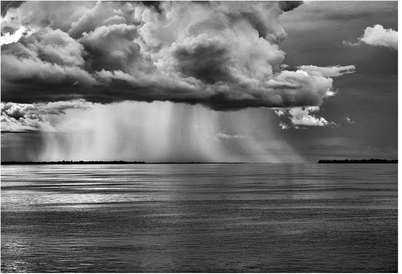
Rio Negro in 2019 in Amazonas state, Brazil