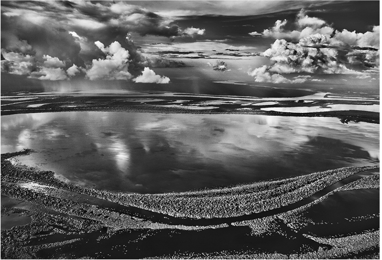
Anavilhanas, forest islands of the Rio Negro, in 2009 in Amazonas state, Brazil