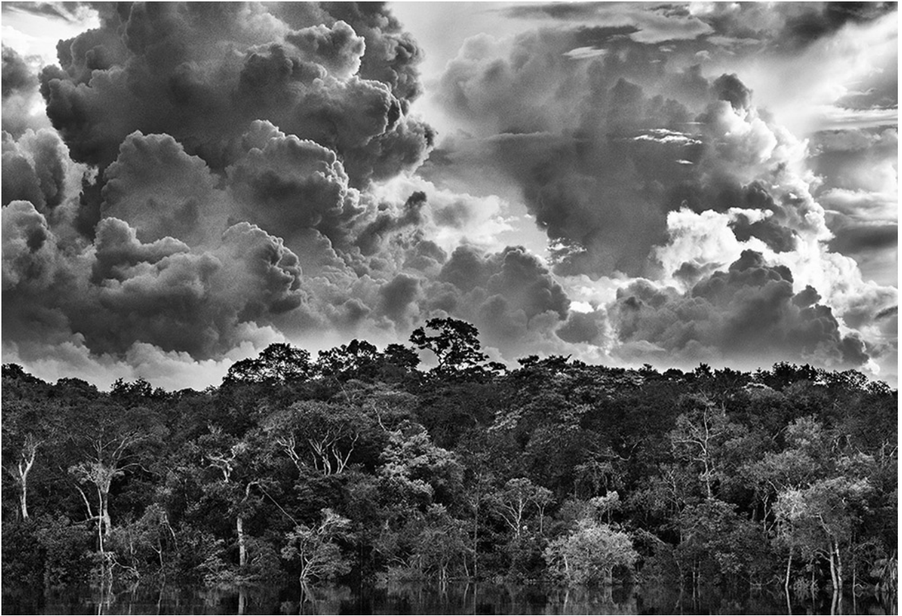
Fluvial archipelago of Mariuá, in 2019 in Amazonas state, Brazil

That call for attentiveness is one that Pope Francis has made since October 2017 when he announced a special synod on the Amazon, one meant to discuss both the pastoral needs of the remote region and to help awaken the world's attention to its destruction.