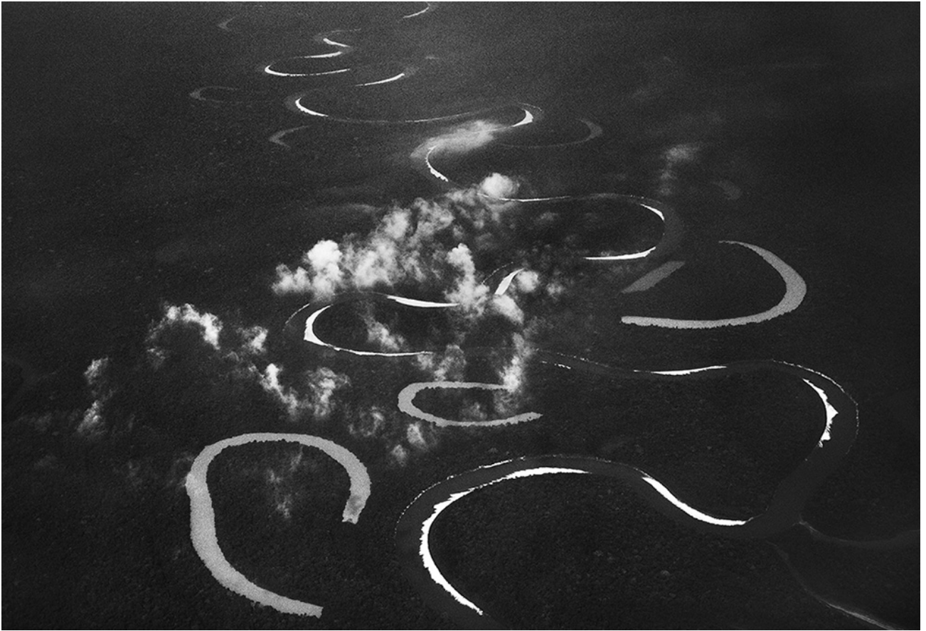
Rio Jutai in 2017 in Amazonas state, Brazil