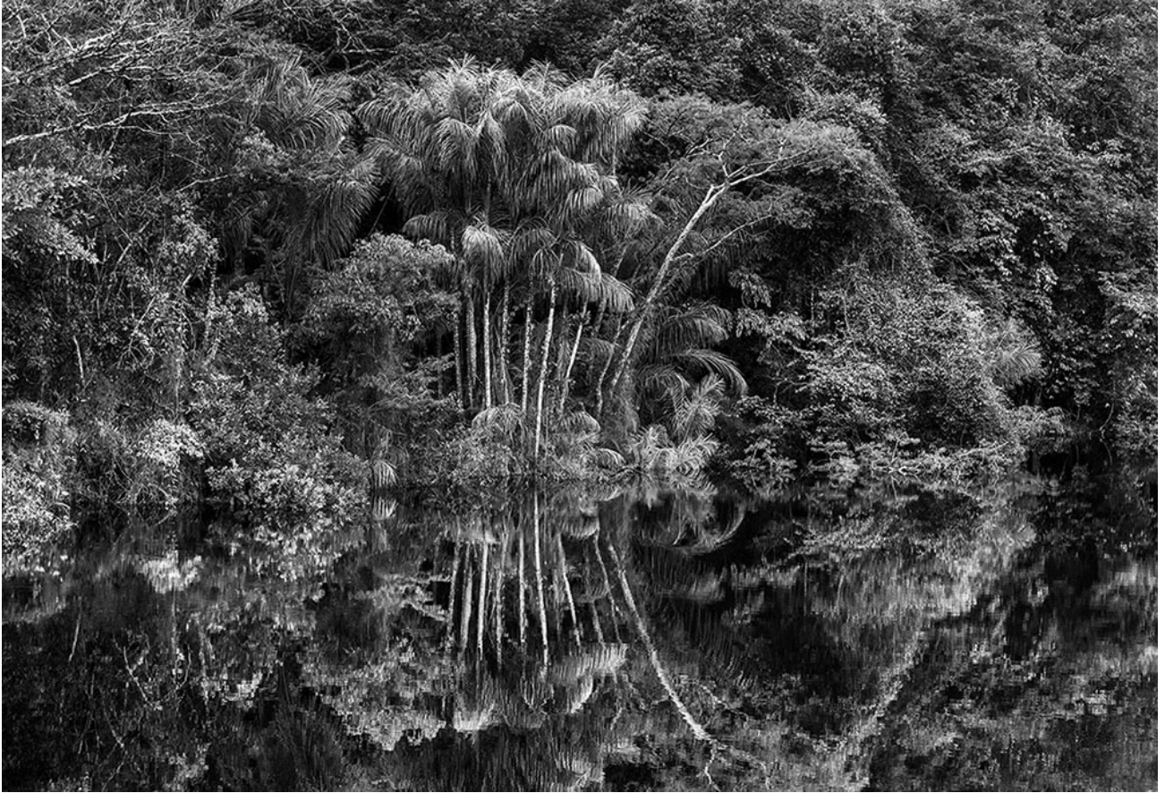
Rio Jaú in 2019 in Amazonas state, Brazil