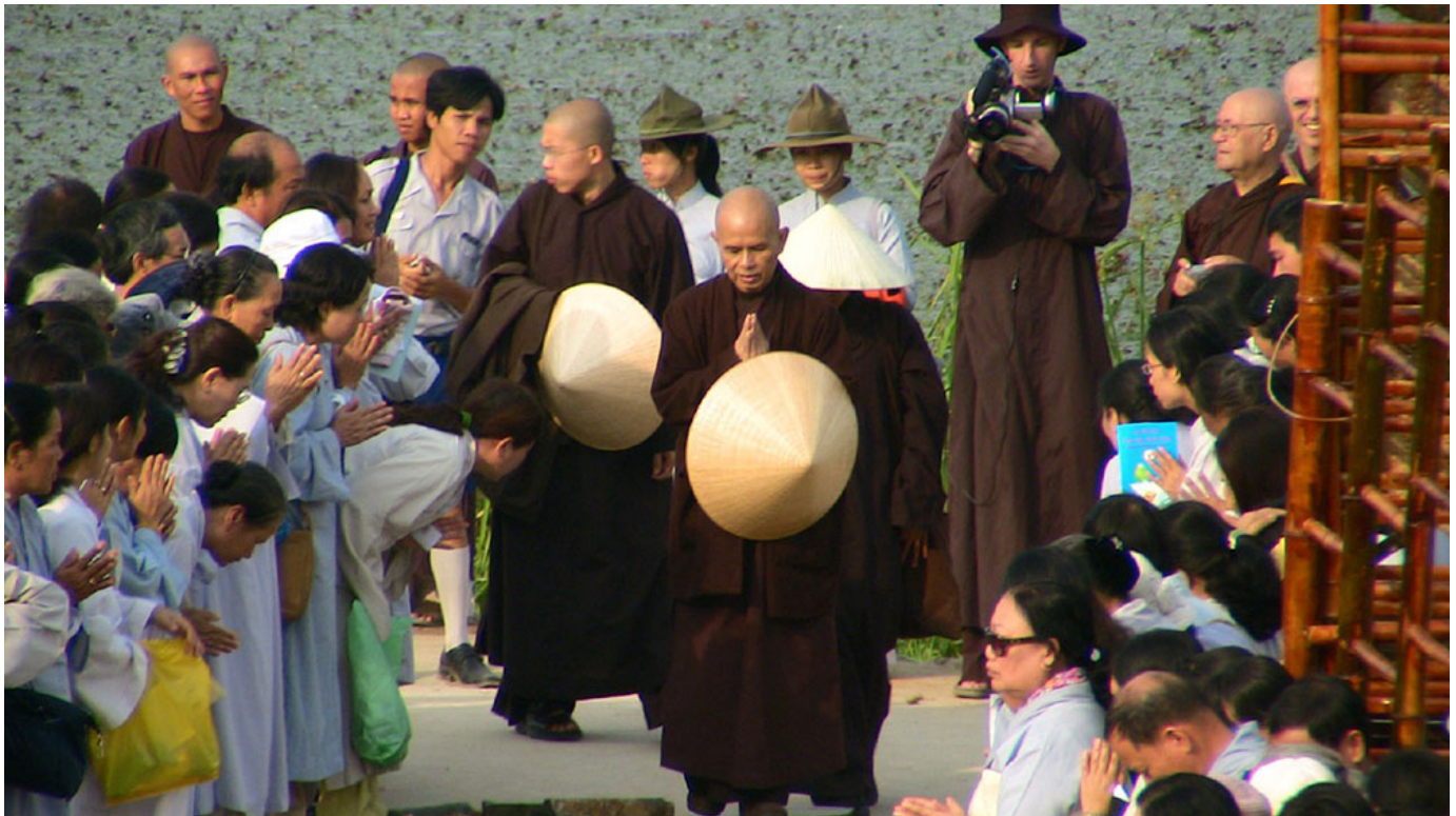
Thích Nhất Hạnh in Vietnam in 2007

Nhất Hạnh published more than 100 books in English, ranging from manuals on meditation, mindfulness and engaged Buddhism, to poems, children's stories and commentaries on ancient Buddhist texts, exposing the West to new Eastern meditation practices.