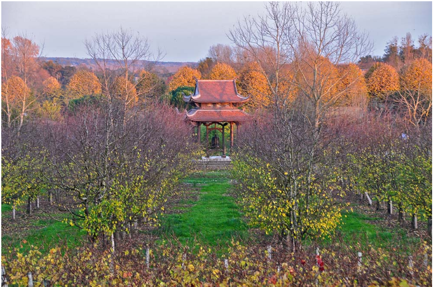
A view of the grounds of Plum Village in France

It was then Nhất Hạnh founded his international retreat center, called Plum Village , near Bordeaux in southwest France, his first Western monastic community. For decades, that would be his new home.