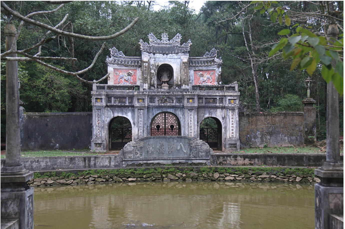
Từ Hiếu Pagoda in Hue, Vietnam

Born in 1926, Nhất Hạnh discovered Buddhism at an early age. He once said he first became interested in Buddhism at the age of 7 or 8 when he saw a picture of Buddha. From then on, he felt called to be a monk and entered the Từ Hiếu temple in Hue in 1942.