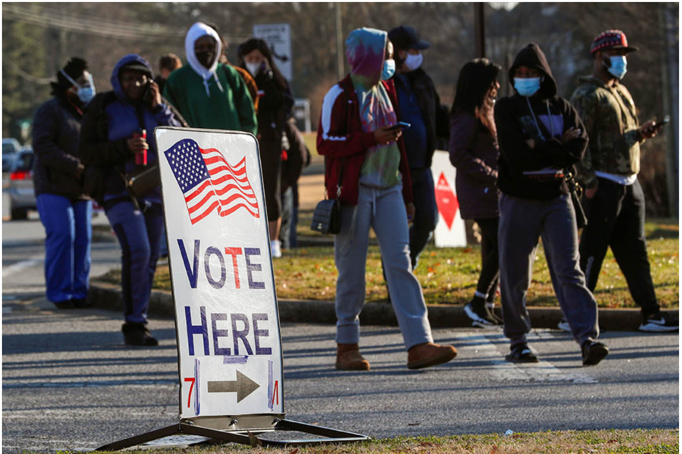
Voters in Marietta, Georgia, line up to cast their ballots in the U.S. Senate runoff election Jan. 5, 2021.