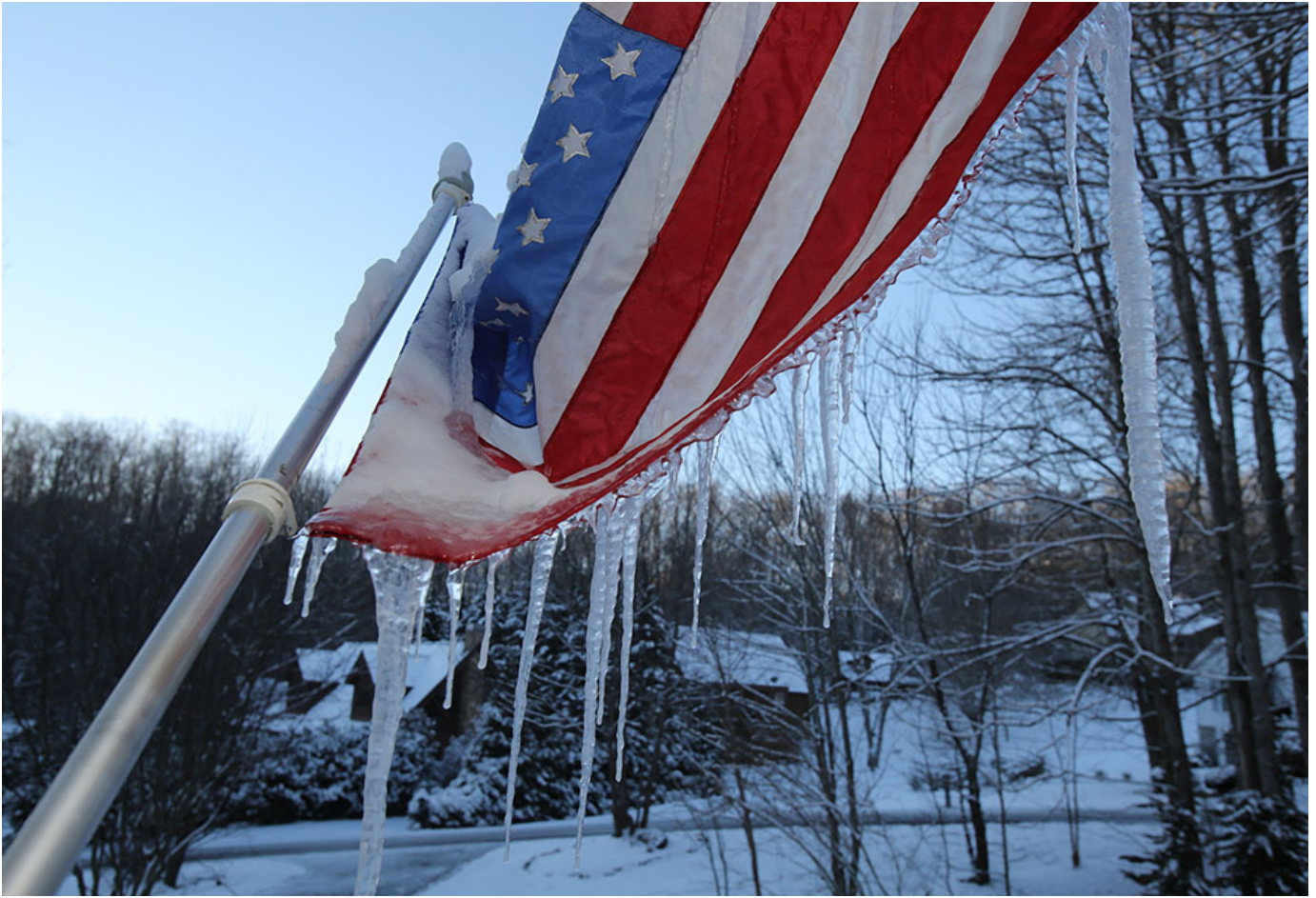
Icicles hang from a frozen U.S. flag on the front porch of a home in Waynesville, North Carolina, Dec. 26, 2020.