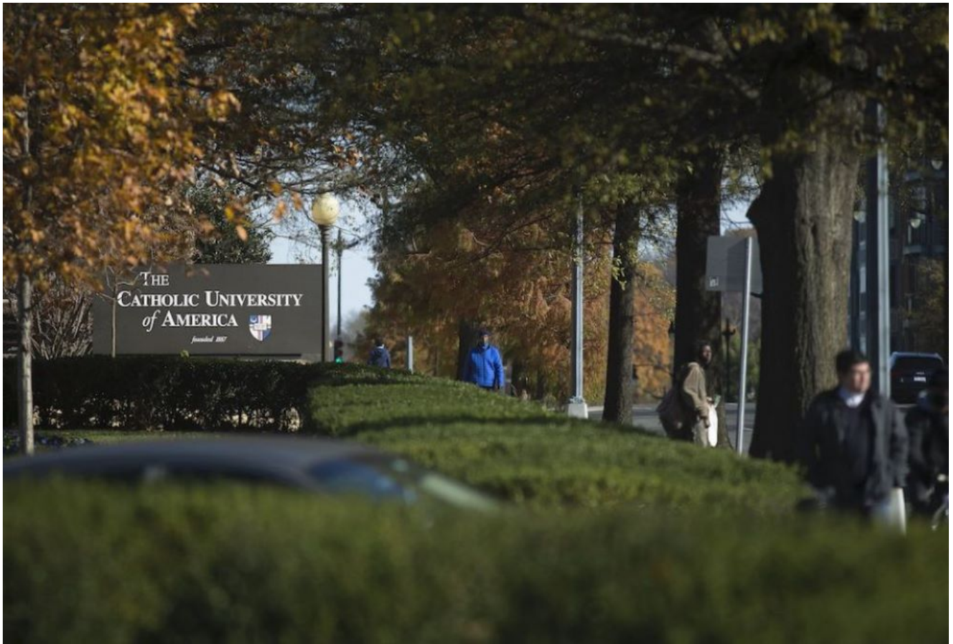
People in Washington, D.C., walk near the campus of The Catholic University of America Nov. 24, 2020.