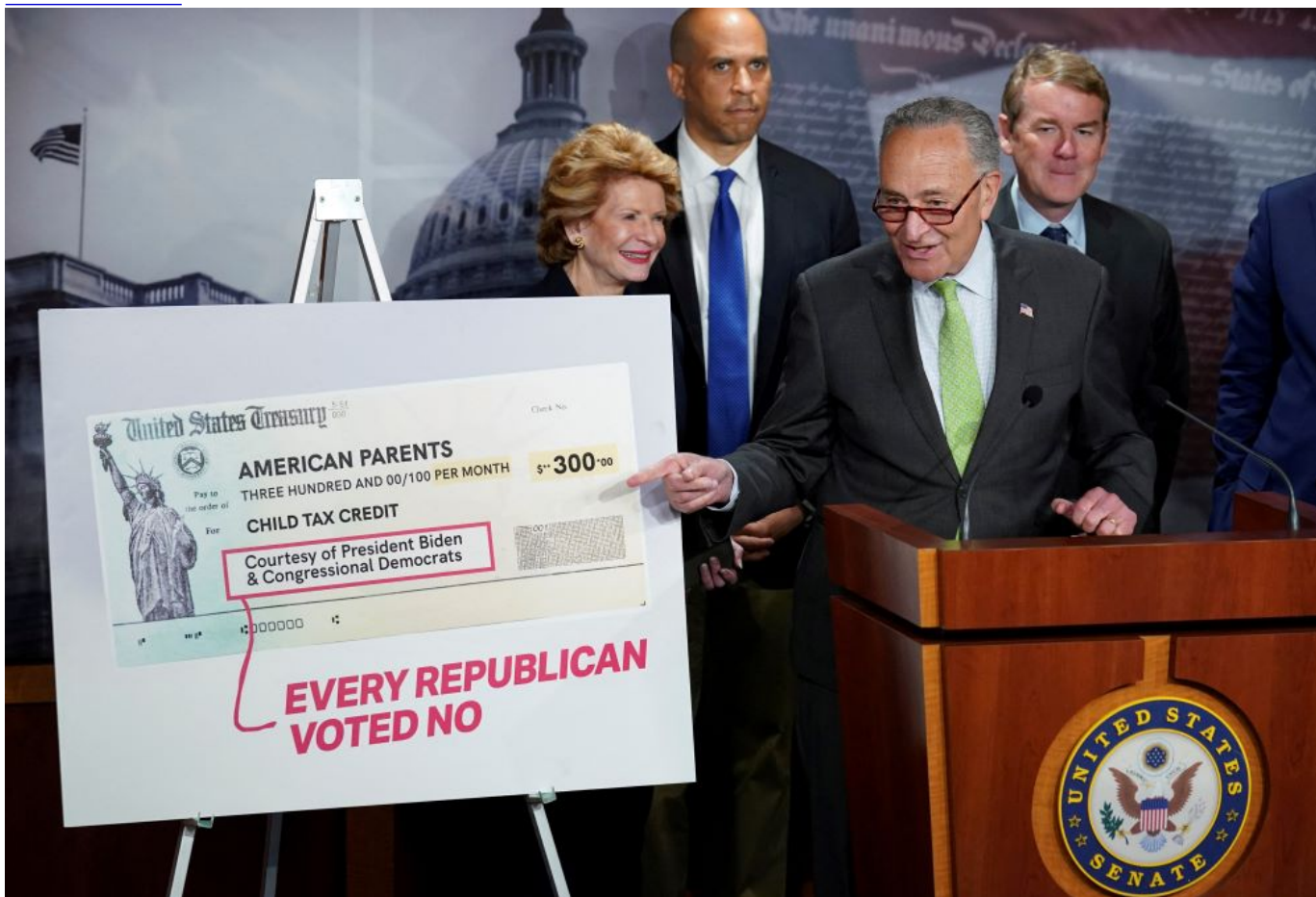
U.S. Senate Majority Leader Chuck Schumer, D-N.Y., holds a news conference at the U.S. Capitol in Washington, D.C., July 15, 2021, about expanded child tax credit payments.