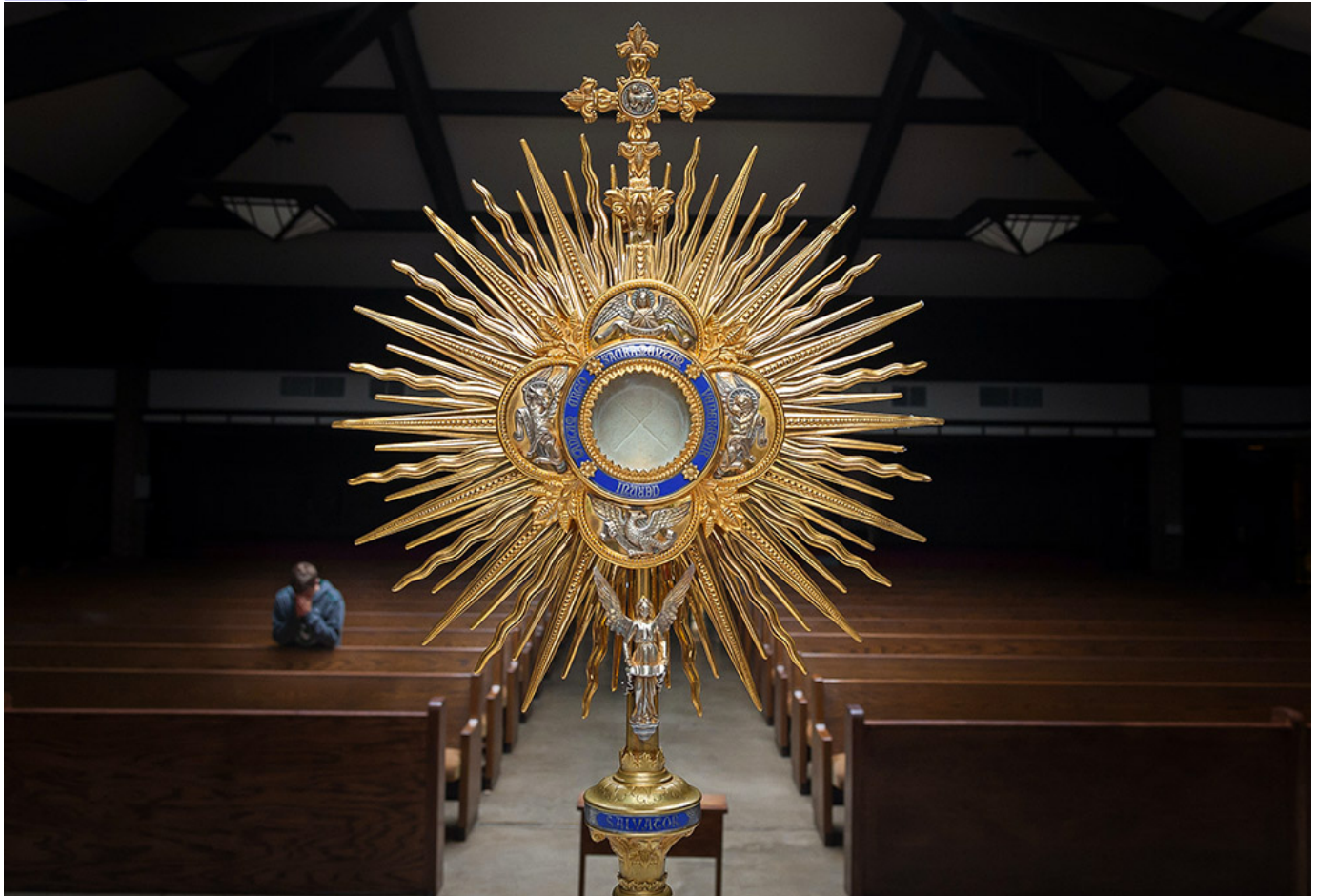
A monstrance holds the Eucharist at a church in Colorado.