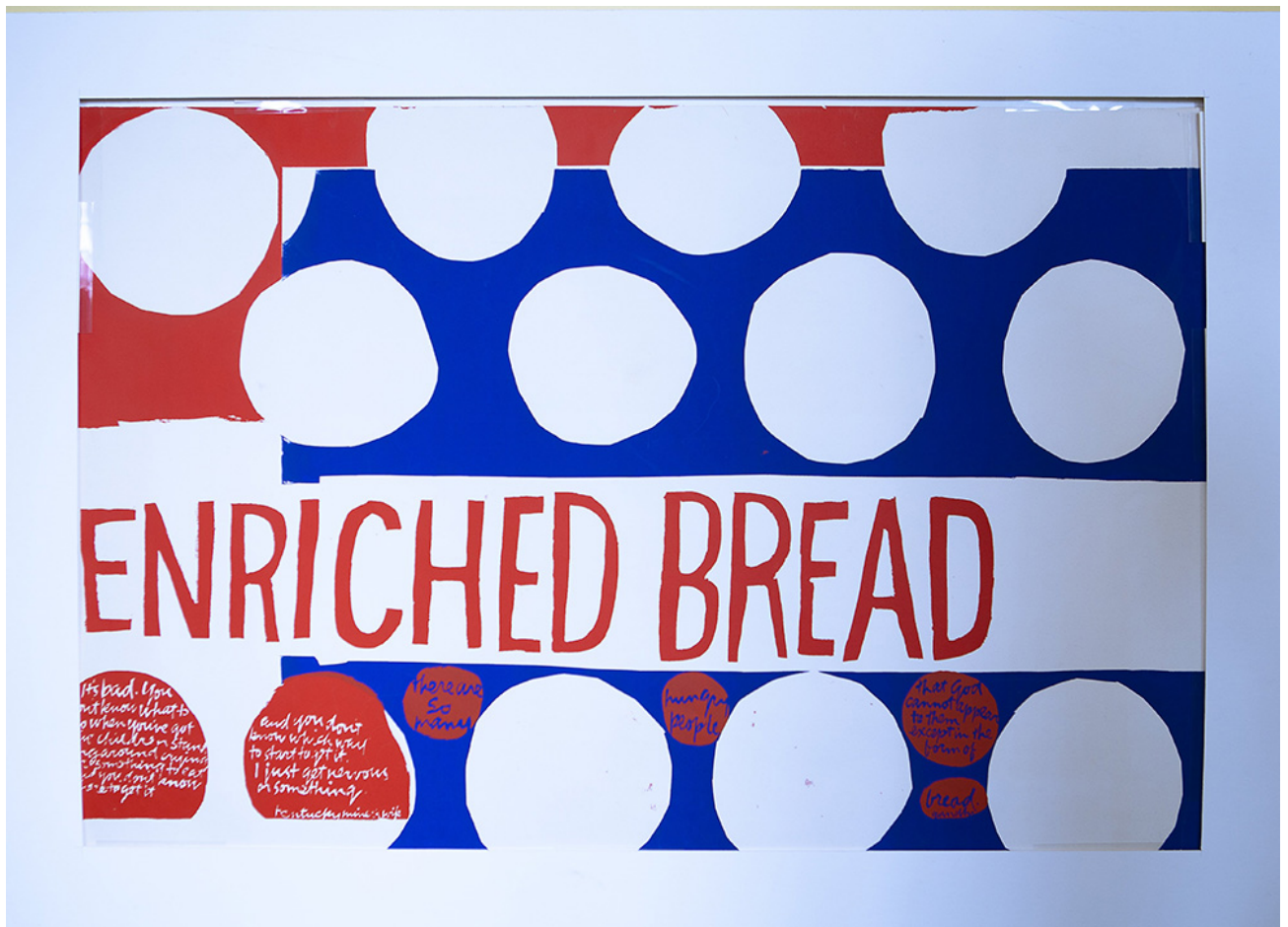
Sr. Corita Kent's 1964 work "That They May Have Life" is seen Feb. 17 at the Theological College in Washington.