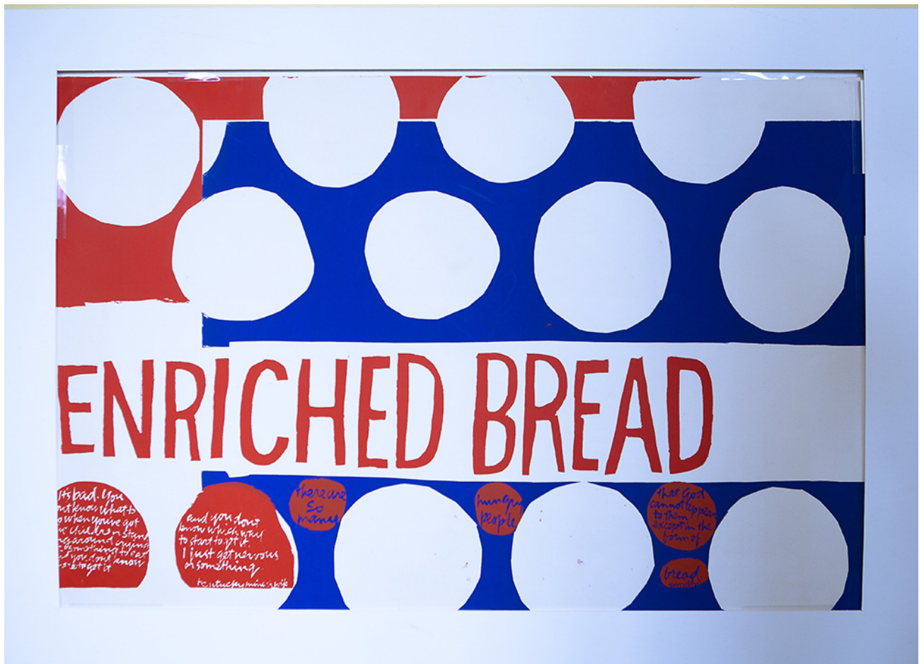
Sr. Corita Kent's 1964 work "That They May Have Life" is seen Feb. 17 at the Theological College in Washington.