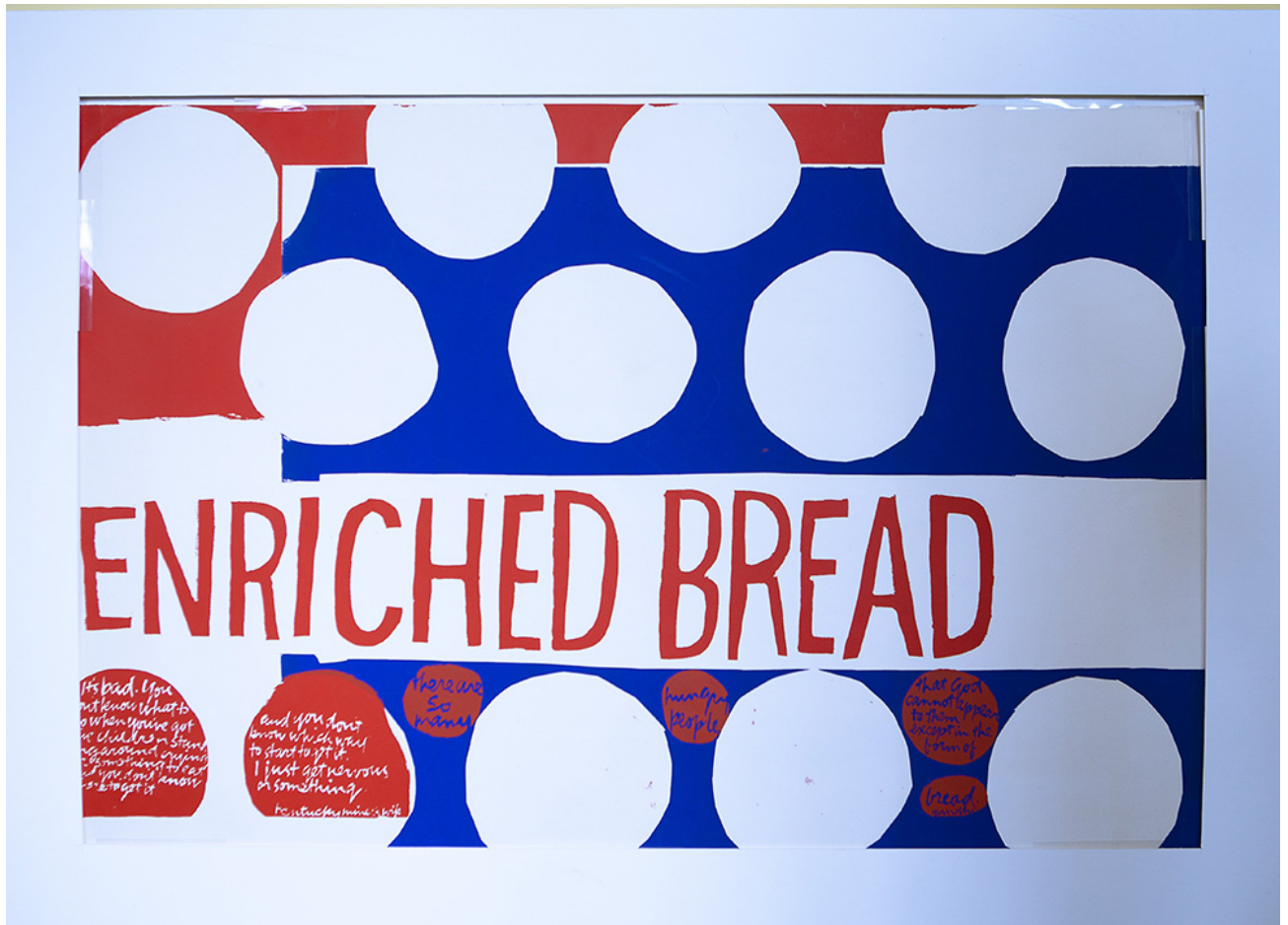
Sr. Corita Kent's 1964 work "That They May Have Life" is seen Feb. 17 at the Theological College in Washington.