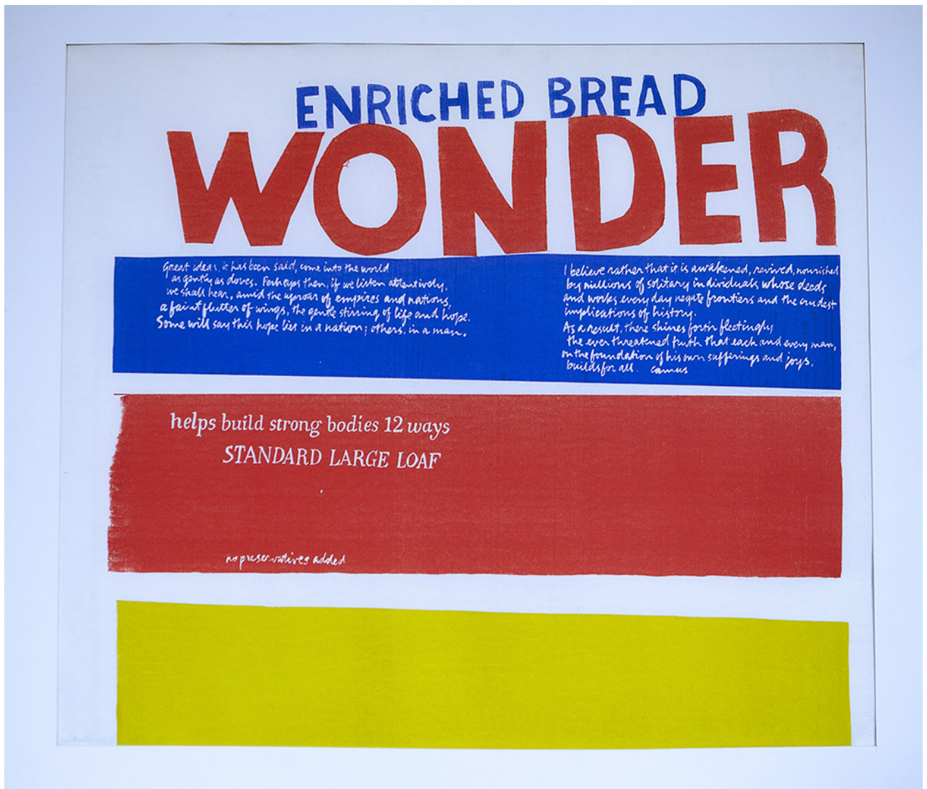
Sr. Corita Kent's 1965 work "Enriched Bread" is seen Feb 17 at the Theological College in Washington.