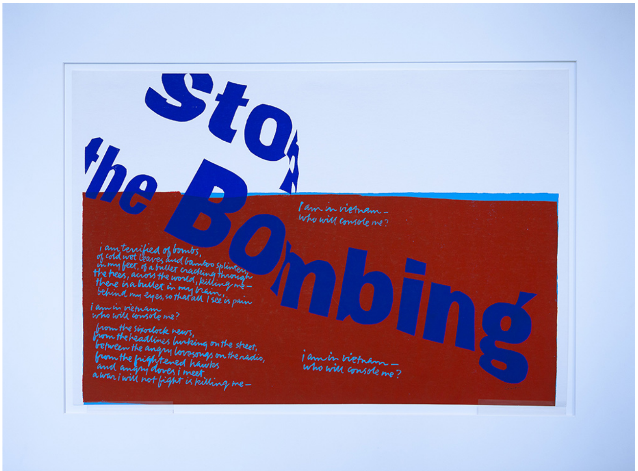
Sr. Corita Kent's 1967 work "Stop the Bombing" is seen Feb. 17 at the Theological College in Washington.

All of a sudden in that swinging decade, God popped up in new guises, no longer locked in a tabernacle to which only a priest had access. And just as Warhol breathed new life into ordinary cans of soup, Corita took the logos and advertising slogans of Wonder Bread to reveal a fresh, modern look at the true Wonder Bread, the Eucharist. "All that is seen and unseen," words heard at Mass in English for the first time, freshly exposed the sacramental nature of ordinary life. "God's not dead he's bread," she famously wrote on one of my favorite prints, pointing out the timeless beauty and power of the Eucharist as something more powerful than a mere weapon of reward and punishment or Sunday obligation.