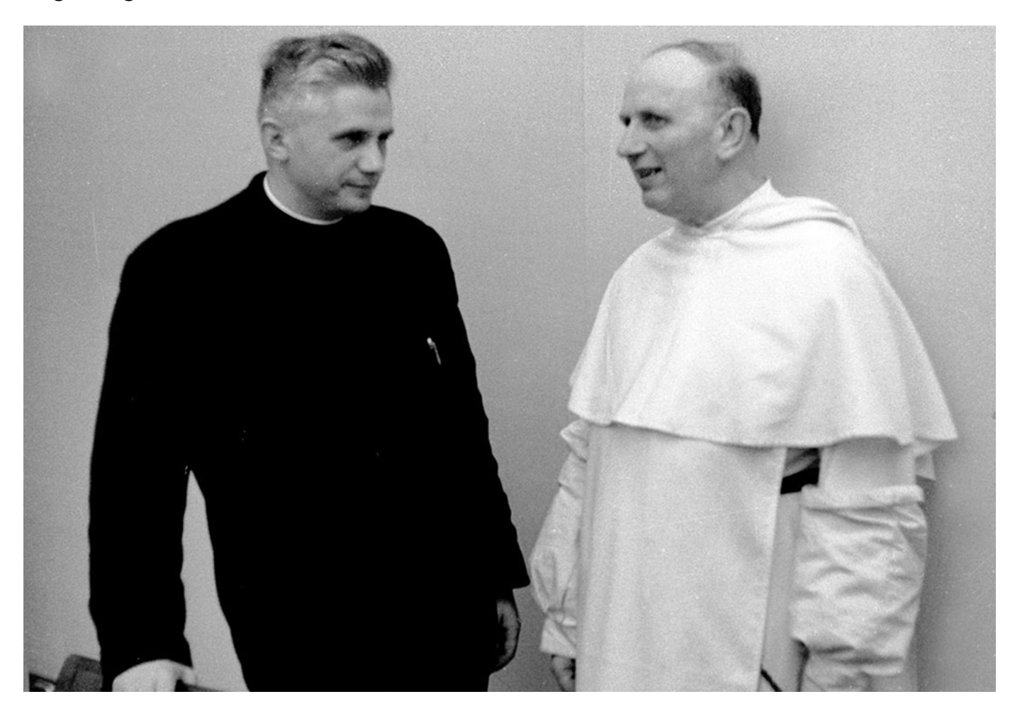
Fr. Joseph Ratzinger is seen with French Dominican Fr. Yves Congar during the Second Vatican Council in 1962. Ratzinger, who became Pope Benedict XVI, gained a reputation as a progressive theologian during Vatican II.

One of the effects of the identification in the U.S. between Benedict XVI's pontificate and Catholic resistance to theological progressivism was the creation of the premises for the transition from Vatican II conservatism to a neo-traditionalist rejection of Vatican II among the Catholic intellectual and clerical elites in the U.S. It was a key turn: a rejection not anymore just of the vague appeals to the "spirit," but also a rejection of the letter, of the documents of Vatican II and their theology. The explosive effects of this expansion of the anti-conciliar Catholic front became clear beginning in March 2013.