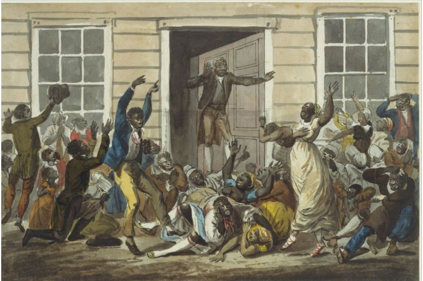
"Black Methodists Holding a Prayer Meeting" by Pavel Petrovich Svinin, circa 1811-1813