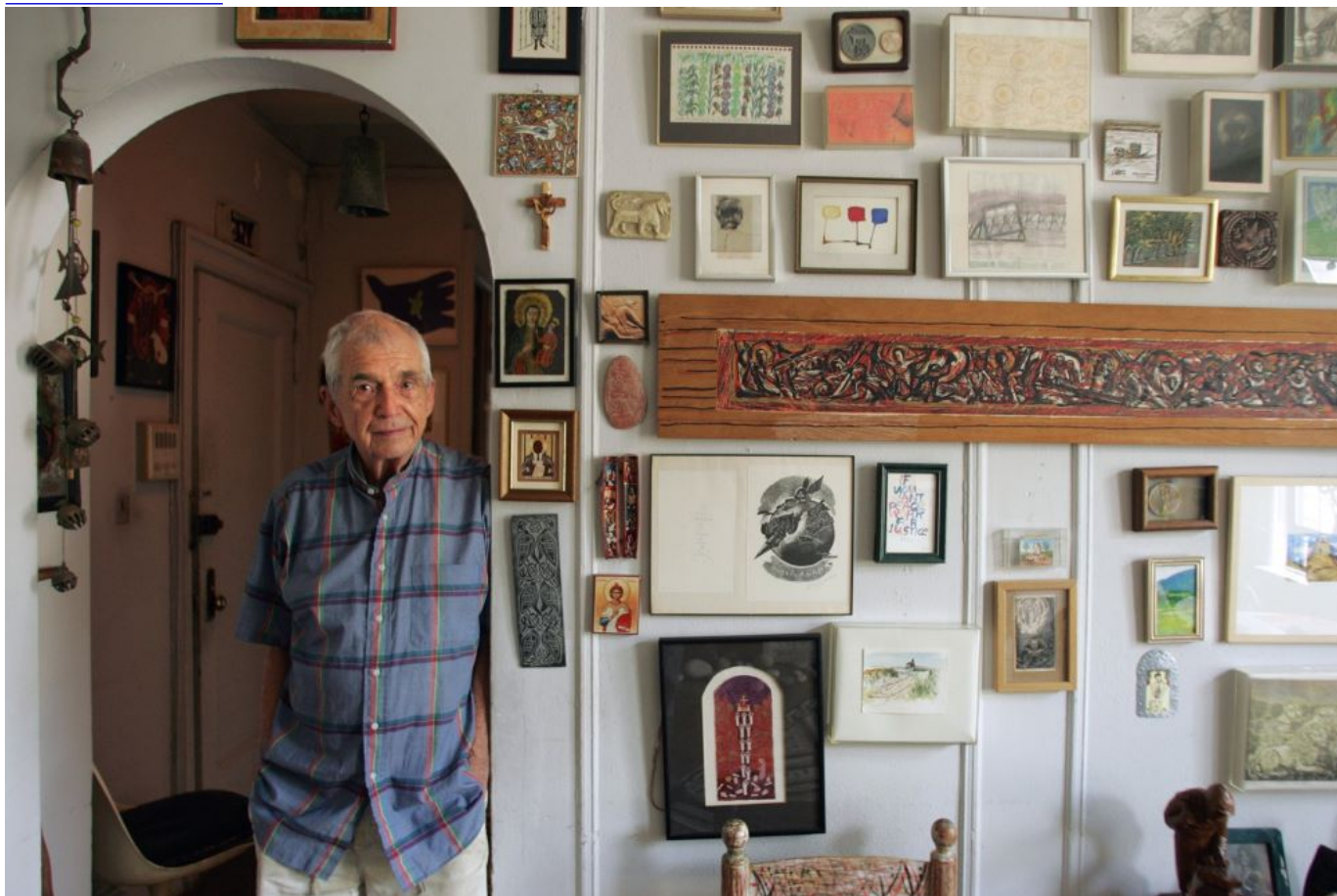
Jesuit Fr. Daniel Berrigan, then 85, poses in his New York City apartment in 2006. Berrigan died in 2016 at age 94.