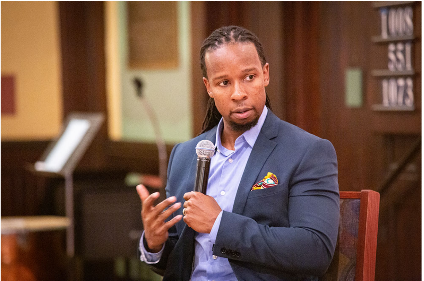
Ibram X. Kendi

In that personal instance, it might seem a bizarre declaration given the chaos and incompetence that followed him into the White House. In a much broader way, however, Ibram X. Kendi argues in the 1619 book that Obama "became" the version of "an American history popularly written as the story of incremental and steady racial progress."