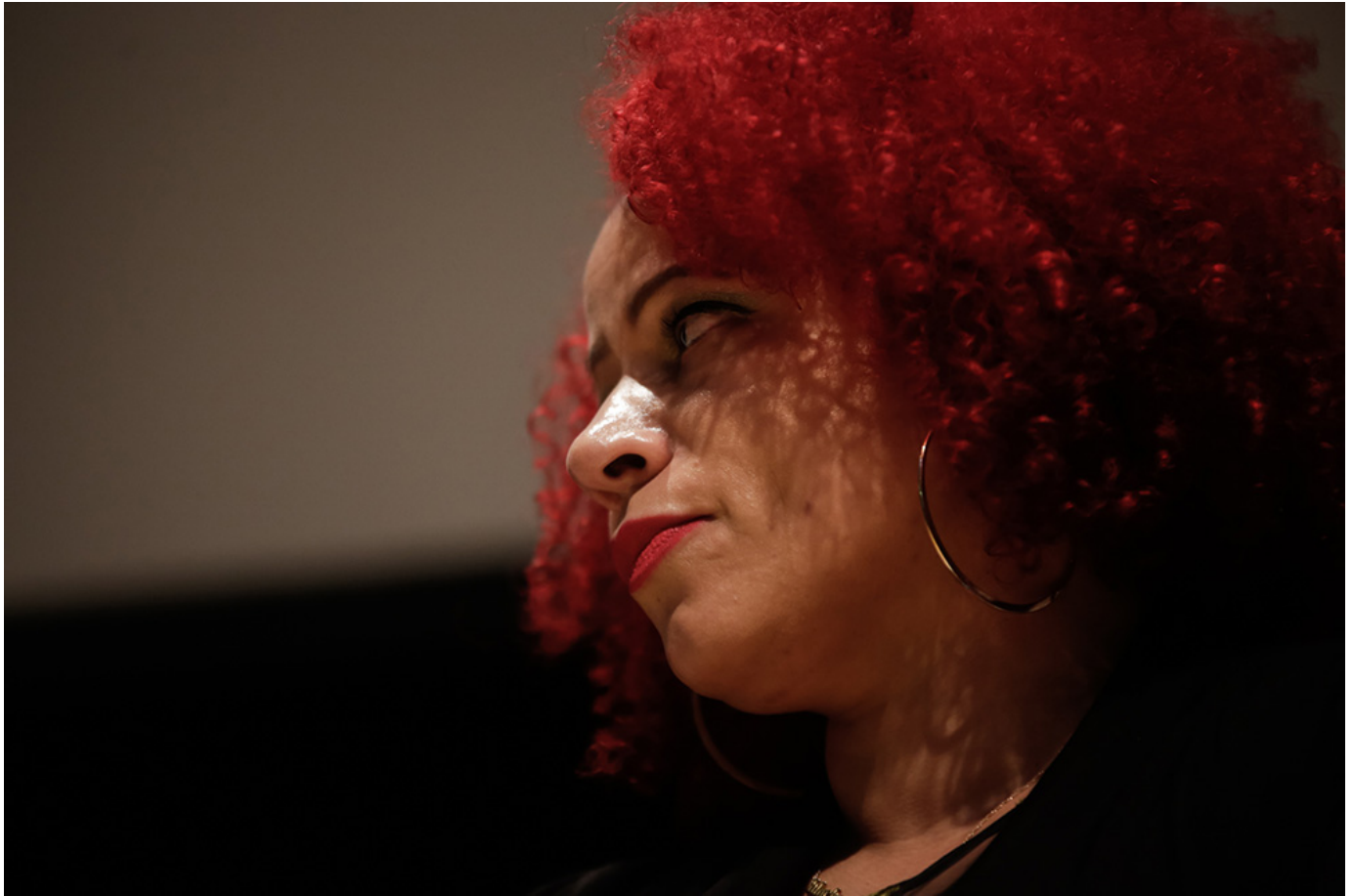
Nikole Hannah-Jones

The question for me provokes reflection, first, in a personal way on very basic realities that still are part of U.S. culture. I know that the presumptions that are packed into my understanding of how I will be perceived in countless situations and what I can take for granted day to day are not the same for my Black neighbors down the hall or in units above and below me in the condominium building where I live.