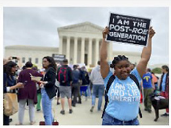
Outside the Supreme Court, Catholics join diverse chorus on abortion