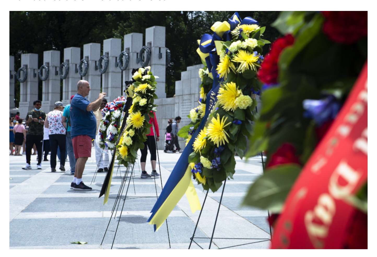
People are seen at the World War II Memorial in Washington during Memorial Day May 31, 2021.

regiment, 29 were killed, 91 wounded and five were missing. The names of the individual soldiers who died are listed.