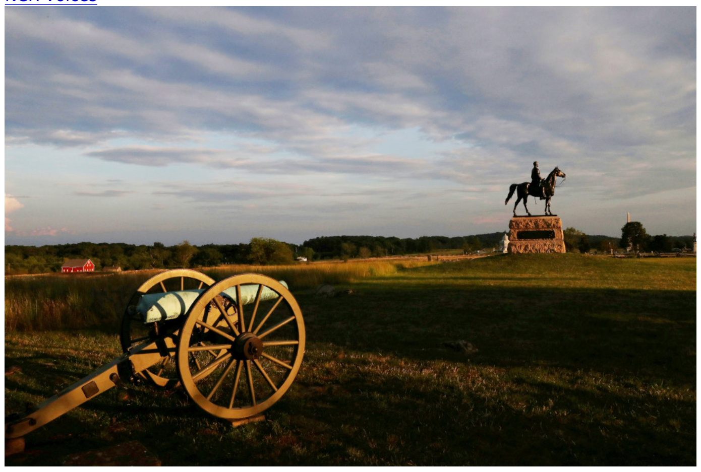
Gettysburg National Military Park in Gettysburg, Pennsylvania, is seen Aug. 11, 2020.