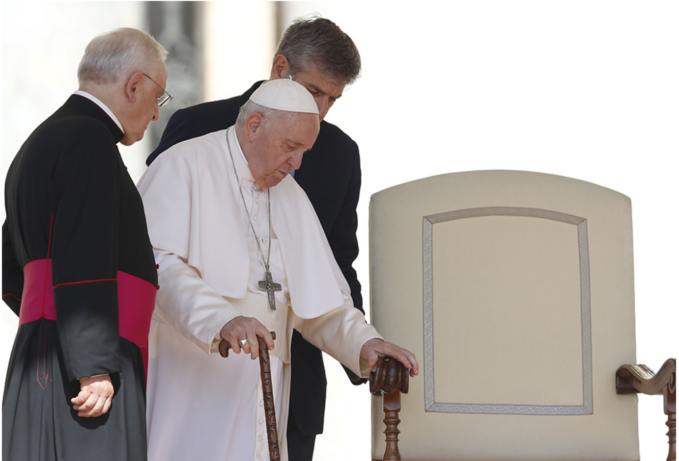
Pope Francis arrives at his chair during his general audience in St. Peter's Square June 8 at the Vatican.