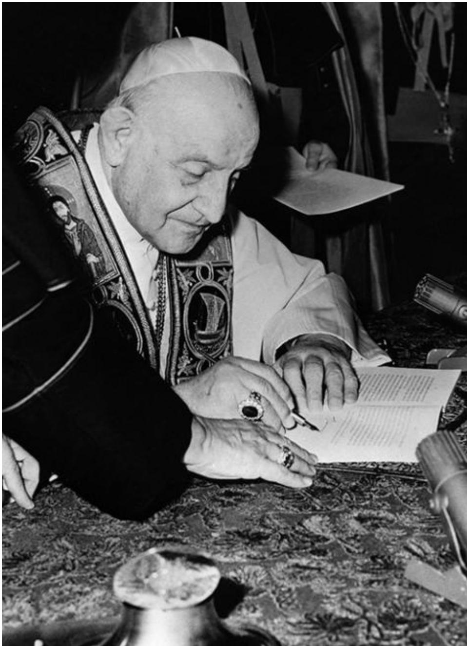
Pope John XXIII signs his encyclical "Peace on Earth" ("Pacem in Terris") at the Vatican in this 1963 file photo.