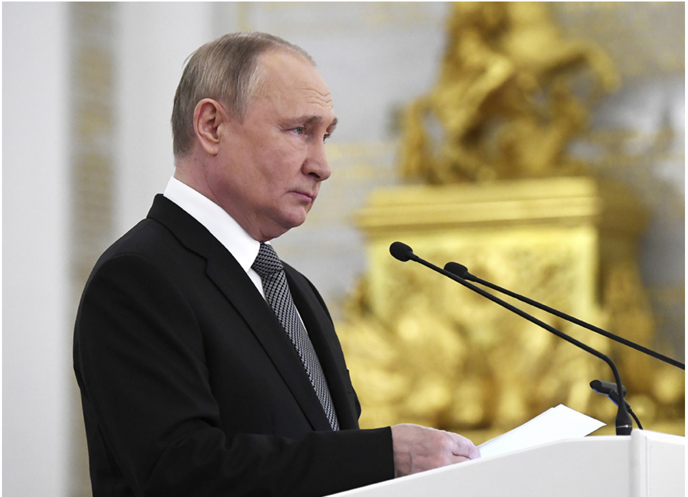
Russian President Vladimir Putin delivers a speech during a meeting with graduates of the country's higher military schools at the Kremlin in Moscow June 21.

Two decades ago, Putin even wanted Russia itself to join NATO ; this tragically wasted opportunity runs contrary to offensive realism theory. Instead, as Robert Person and Michael McFaul argue, what Putin feared was never NATO expansion but rather the spread of democratic values. Kremlin complaints about NATO were correlated with upsurges of democratic reform movements within Russia inspired by the Arab Spring in 2011 and later by Ukrainians ousting Putin's puppet ruler in Kyiv.