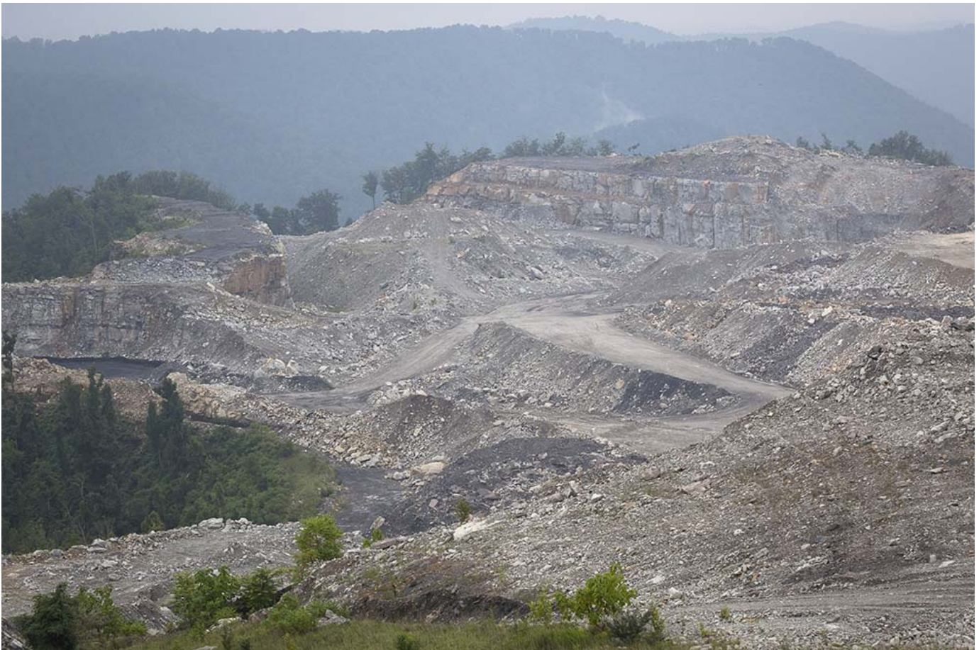
A mountaintop-removal coal mine on Kayford Mountain south of Charleston, West Virginia, is seen in 2014.

"Congress is not always able to pass a law the instant that we learn something new about a virus or about a pollutant, or about, you know, machinery that fails on the workplace. ... Since almost the beginning of the republic, the whole idea behind having agencies is that we give them directives, and that they act in ways that are flexible, and smart, and based on expertise to protect people," he said.