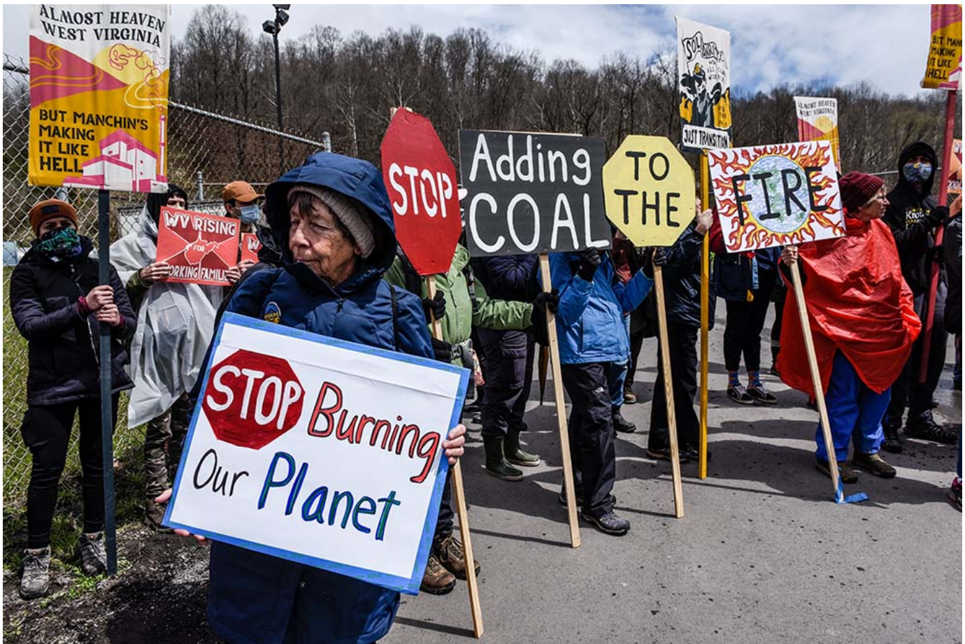
People in Grant Town, West Virginia, protest the Grant Town Coal Waste Power Plant April 9.

more dangerous heat waves, flooding, droughts and extreme storms.