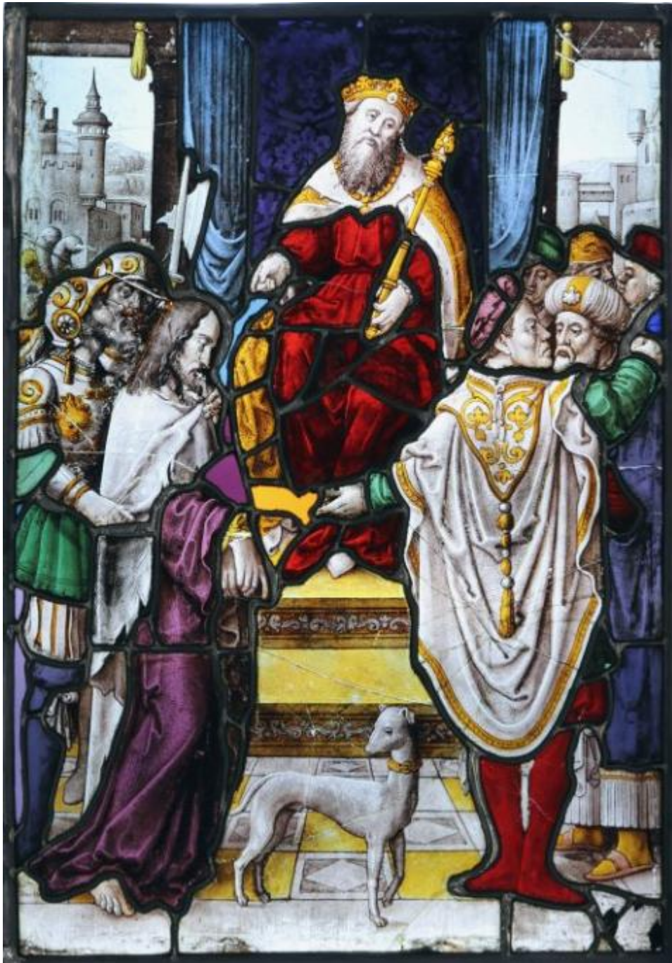
Christ Before Herod by Flemish, Leuven

Antipater, Herod and their descendants would continue to rely on Rome as long as their dynasty remained in power. They were remarkably skilled at remaining in