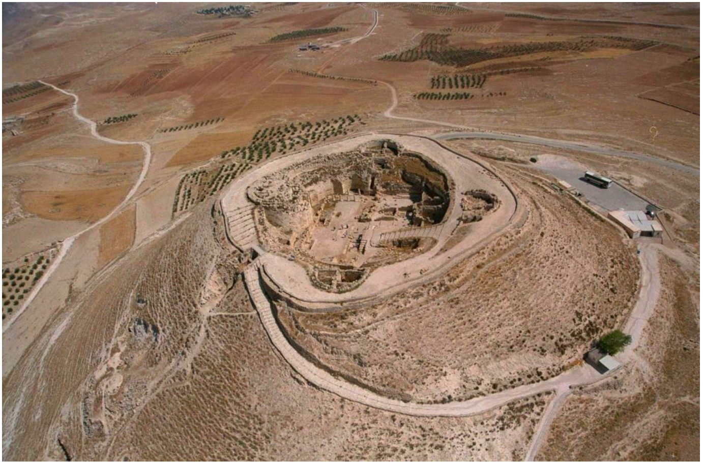
Herodium, the desert site of King Herod the Great's fortress and palace, is seen in this May 25, 1998, photo released by the Israeli Government Press Office.

Heroic he was. The strapping son of an Idumaeen warlord named Antipater , Herod benefited from his father's deft use of the politics of religion to supplant the ruling Maccabean dynasty. Chilton's research is necessarily based on the work of one man: first century Jewish historian Flavius Josephus . It was Josephus who coined the term " theocracy ," a word he used to describe the unique interplay of Judaism and political power at work in the Maccabean and Herodian courts.