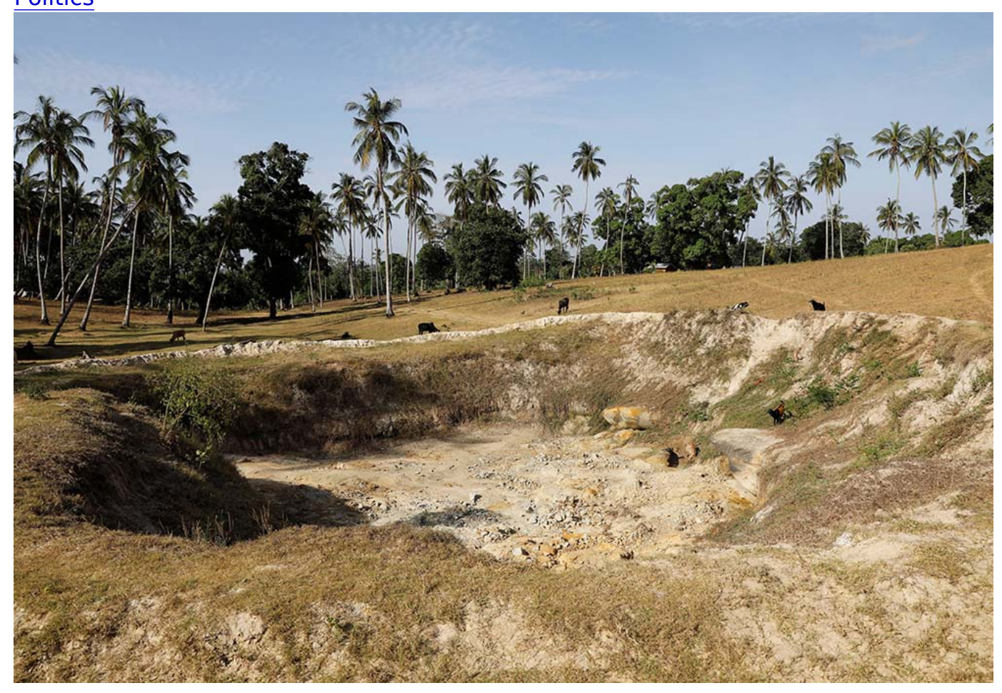
A dried-up water hole is seen in Kilifi, Kenya, on Feb. 16.