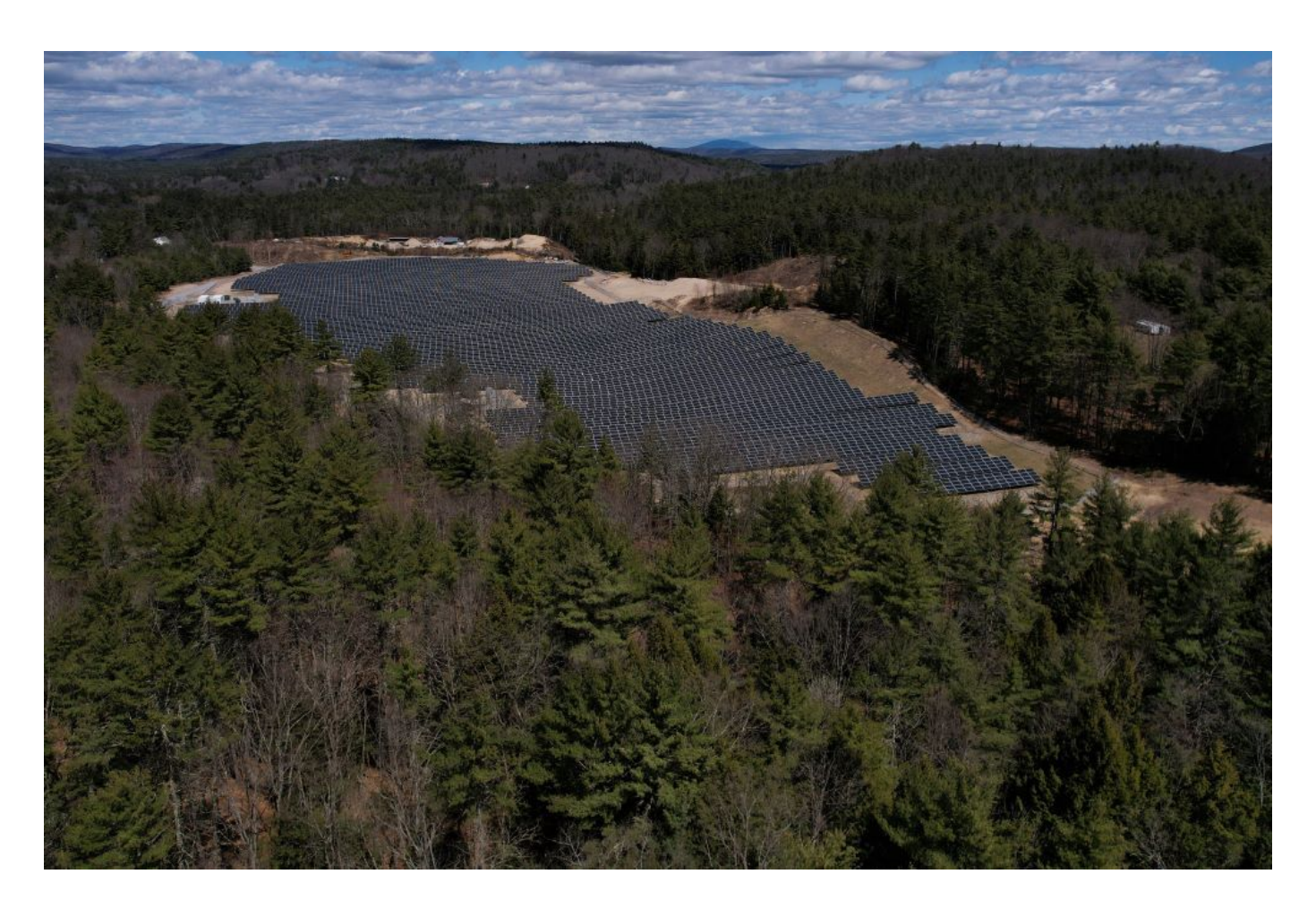
Solar panels are seen on Earth Day in Athol, Mass., April 22, 2022.

Supporters hope the law, in addition to its new investments, unleashes momentum in the market and among states to accelerate the nation's transition to clean energy and make up the gap in the national emissions-reduction target.