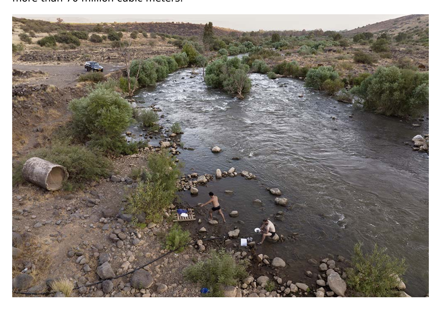
People bathe in the Jordan River near Kibbutz Karkom in northern Israel on July 30.

1.3 billion cubic meters, according to a report published in 2013 by a U.N. commission and a German federal institute. Bromberg puts the current figure at no more than 70 million cubic meters.