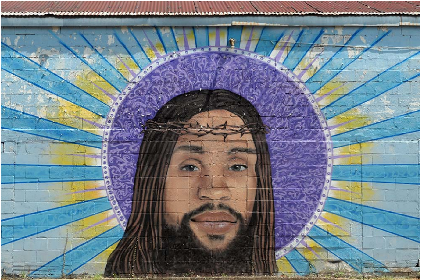
A mural of Jesus at the Way Jesus Christ Christian Church in New Orleans

These verses related to justice are only a few of many, many more found in the Bible. And yet somehow white Christians have found ways to ignore these verses that are at the heart of their sacred scripture. Meanwhile, the Black church has read them and found a God who is on their side, a God who identifies with their suffering — a God who is with them. In the stories of the Hebrew slaves' exodus into freedom and Christ's suffering at the hands of his oppressors, Blacks found a God who no longer wore a white man's face.