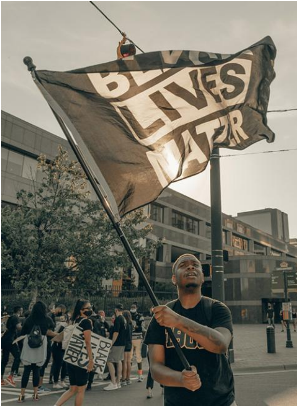
Charlotte, North Carolina, 2020

As we become aware of the Divine Presence within the suffering of the Black community, we are challenged to affirm, "Black lives matter." And yet I have had friends counter this statement with the response that "all lives matter." Of course all lives matter; that should be a self-evident fact. But for centuries, Western society has been built around the assumption of white supremacy. We do not need to assert that "white lives matter," because no one has ever contradicted that fact.