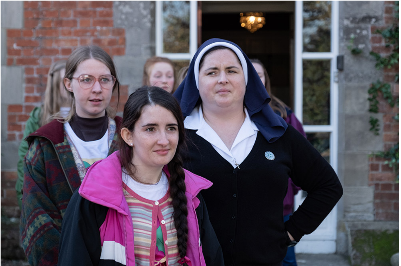
Siobhán McSweeney, right, as Sister Michael in "Derry Girls"

To American viewers, much of this Catholic-poking might seem offensive or profane, especially given the number of F-bombs the characters regularly drop. There are outrageous plots involving weeping statues and Grandpa Joe picking up a girlfriend at Stations of the Cross. (Erin: "Which station?" Grandpa Joe: "Jesus falls a second time.")