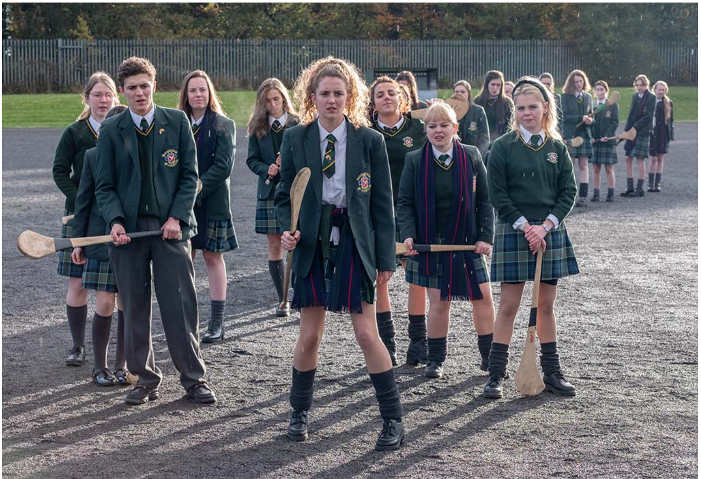
The cast of "Derry Girls" in Season Two

Father Peter's attempt to boil it all down to "We all feel, love, dream" only confuses the group. In the end, the kids find their own common ground: parents.