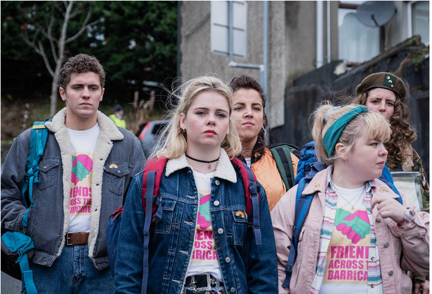
From left: Dylan Llewellyn as James, Saoirse-Monica Jackson as Erin, Jamie-Lee O'Donnell as Michelle, Nicola Coughlan as Clare, and Louisa Harland as Orla in "Derry Girls"