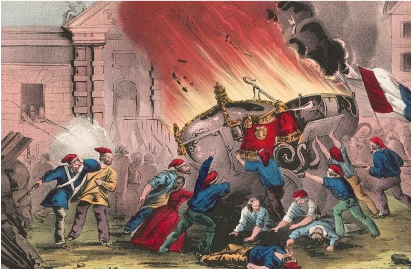
An image depicts burning royal carriages at the Chateau d'Eu during the French Revolution, c. 1848. (Library of Congress/N. Currier)