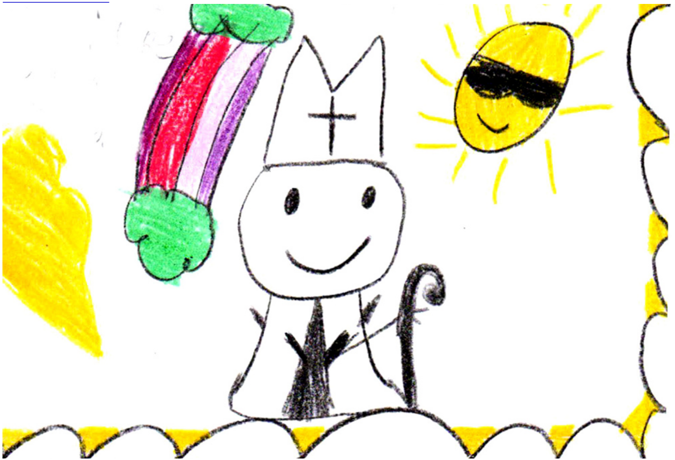
Artwork from a letter by a Robb Elementary student who wrote to Pope Francis