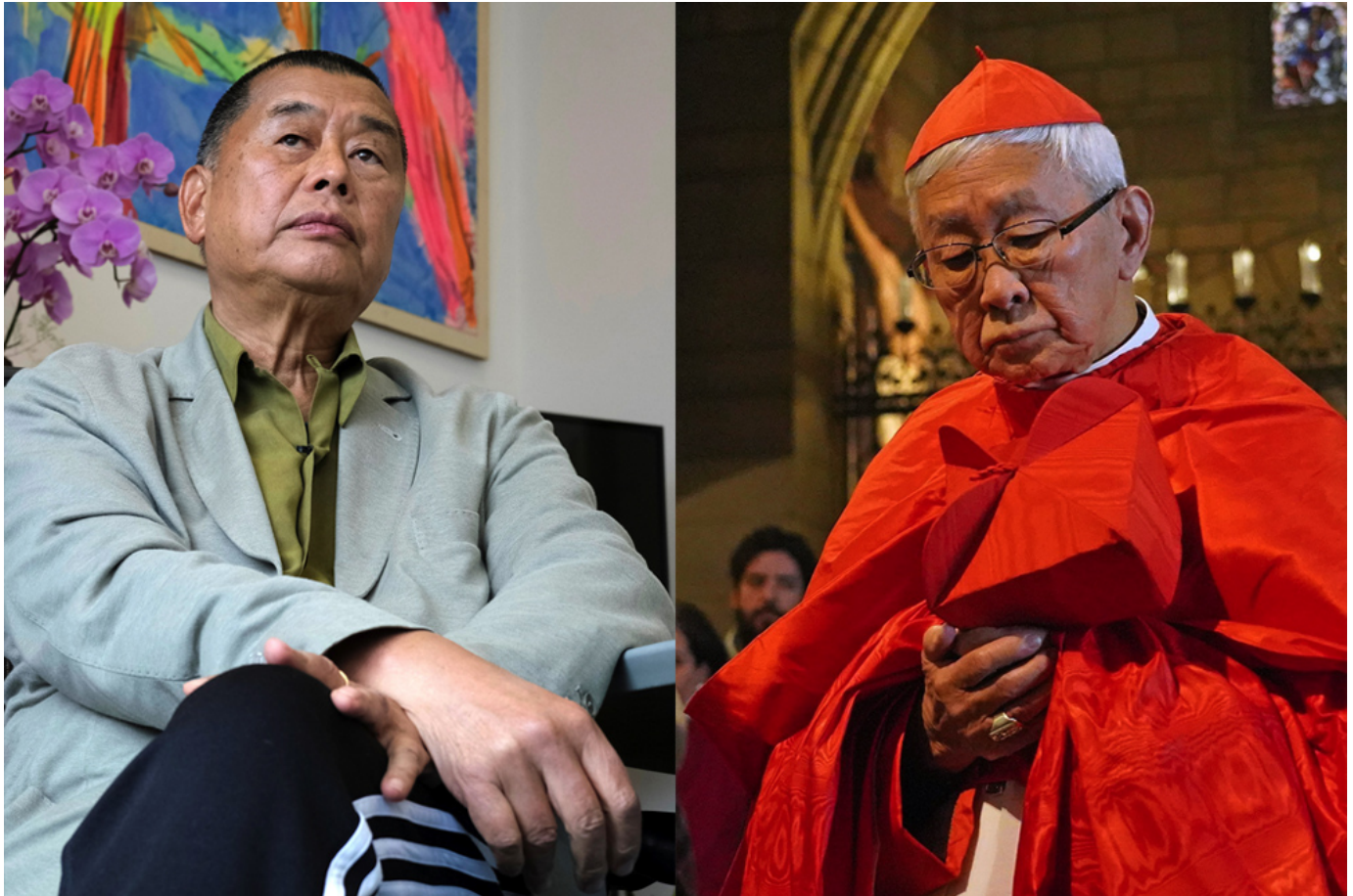
Catholic media tycoon and philanthropist Jimmy Lai in May 2020 ; right: Cardinal Joseph Zen Ze-kiun, retired bishop of Hong Kong, in February 2020