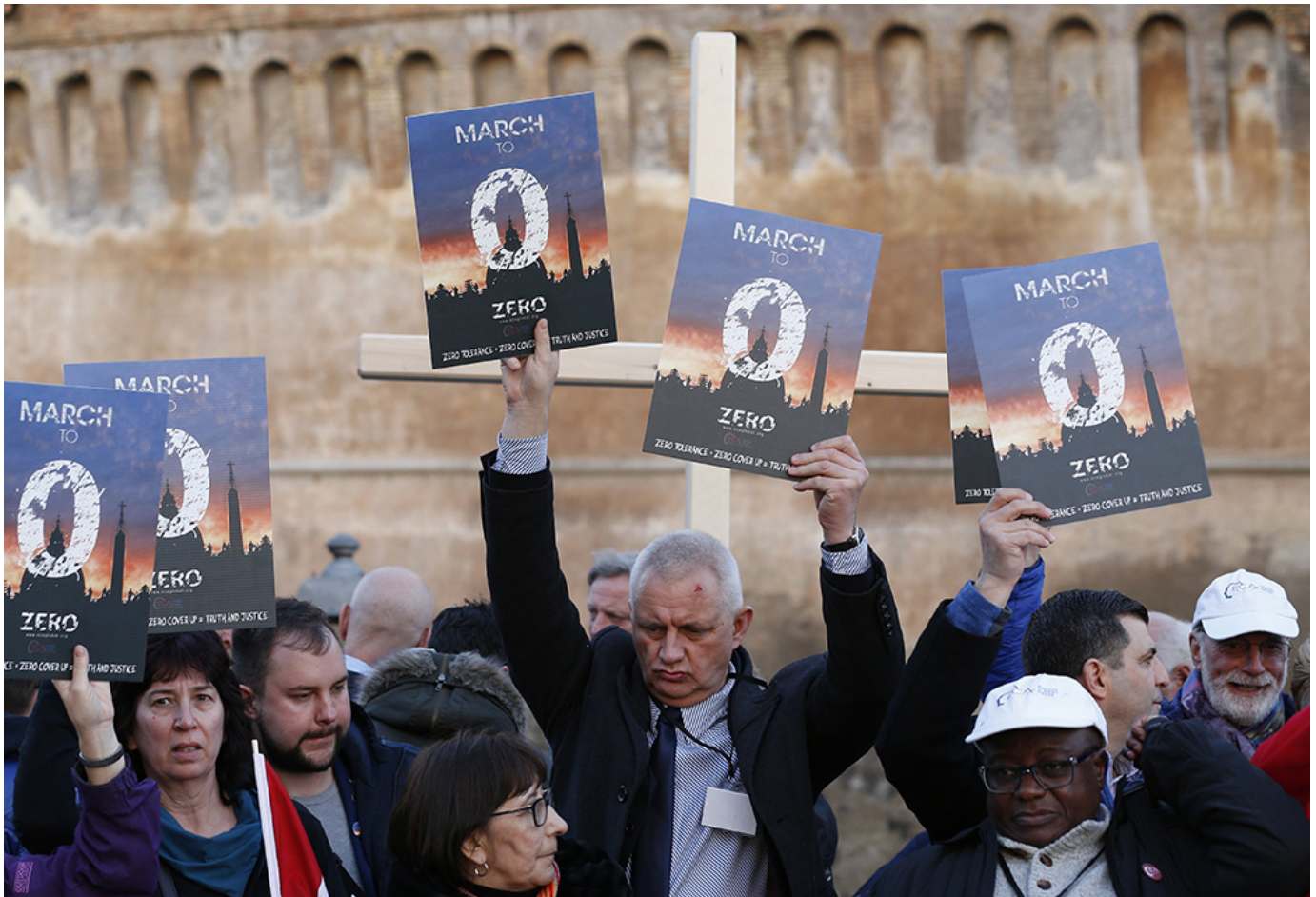
Clerical sex abuse survivors and their supporters rally outside Castel Sant'Angelo in Rome in this Feb. 21, 2019, file photo.

Third dimension: Something that is emerging is the uncertainty or uselessness of the distinction between the clerical hierarchy and multi-vocation charismatic communities, especially in a church that wants to be, in its evangelizing and missionary efforts, all-ministerial. We have come a long way from the time when this could be called the "clergy abuse crisis" — and it's surprising that some scholars are still treating this crisis as something that can be explained mono-causally with clericalism, or with the unique role of the clergy in the Catholic Church.