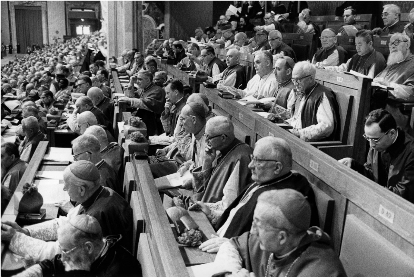
Bishops are pictured in a file photo during a Second Vatican Council session inside St. Peter's Basilica at the Vatican.