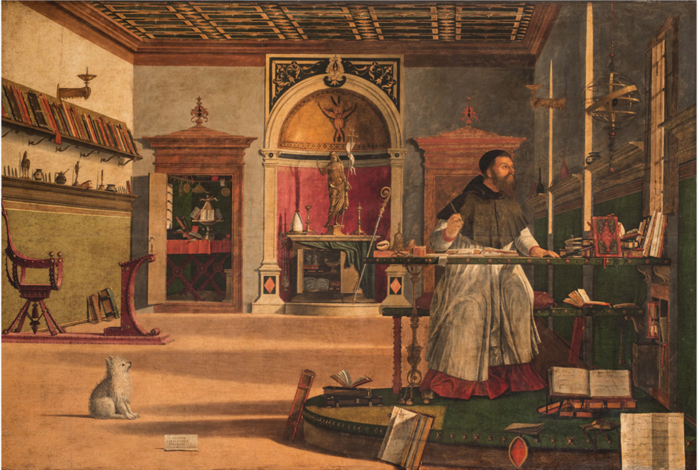
"St. Augustine in His Study" (shortly after 1502) by Vittore Carpaccio. Scuola Dalmata dei Santi Giorgio e Trifone, Venice.