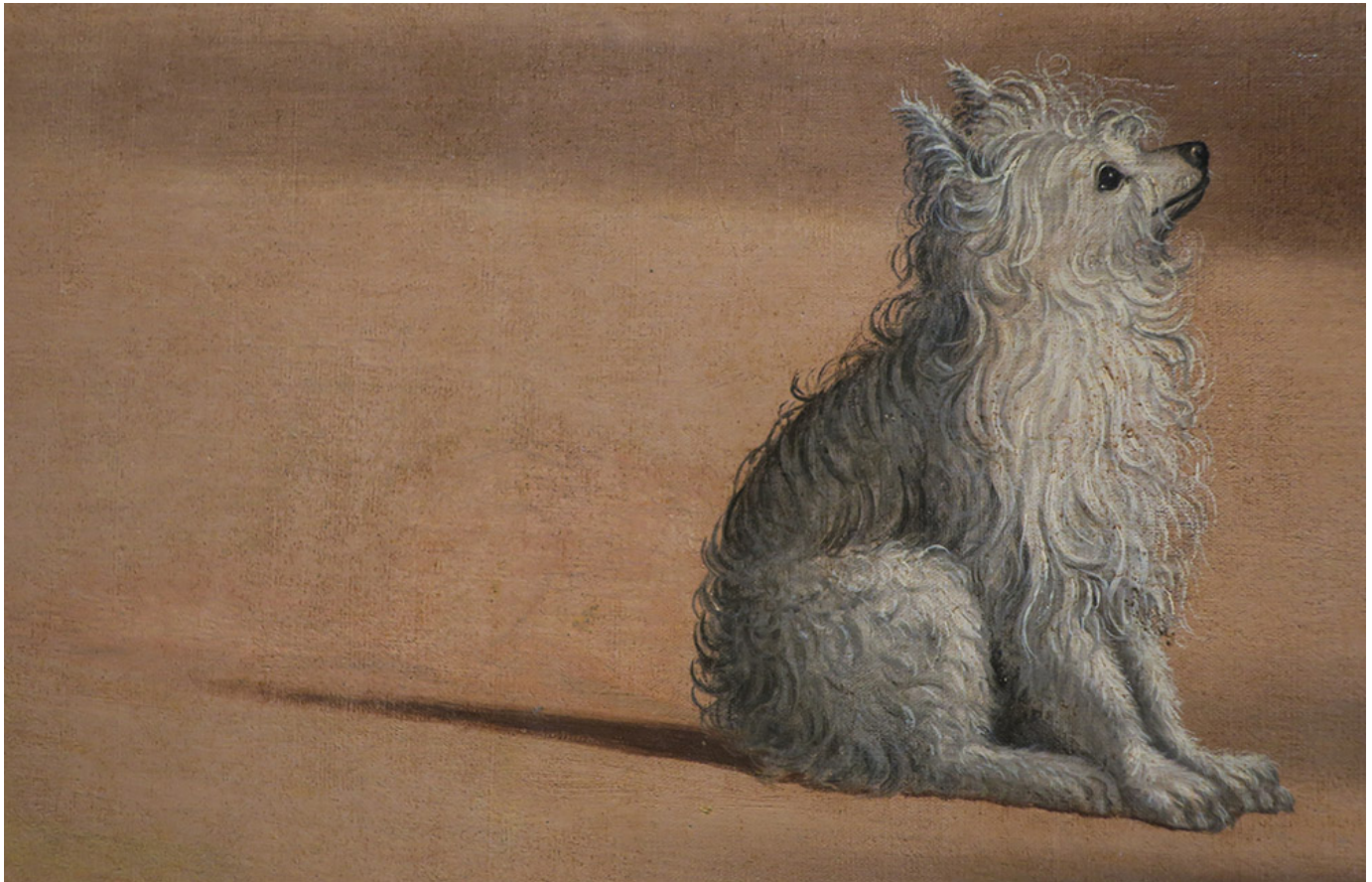
Detail of the dog (with hint of painted-over ermine) in Vittore Carpaccio's "St. Augustine in His Study" (shortly after 1502). Scuola Dalmata dei Santi Giorgio e Trifone, Venice.

The painting substitutes a dog — symbolic of fidelity — for the ermine, and infrared scans reveal Carpaccio originally painted an ermine before opting for a canine symbol. Both the drawing and painting display dramatic light and shadow, as Carpaccio decided how to depict the miraculous light, which tipped Augustine off to Jerome's passing.