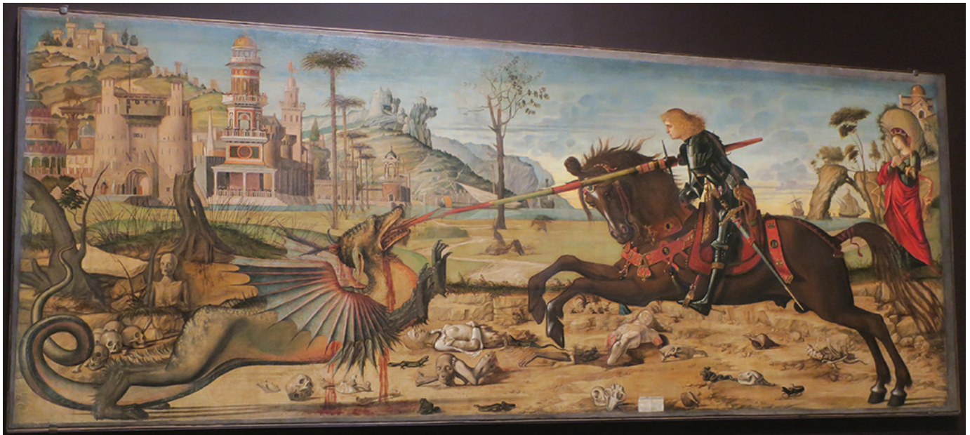
"St. George and the Dragon" (circa 1504-1507) by Vittore Carpaccio. Scuola Dalmata dei Santi Giorgio e Trifone, Venice.

Beholding the wall-sized picture in person, it is easy to imagine Carpaccio's contemporaries might have considered it a kind of documentary.