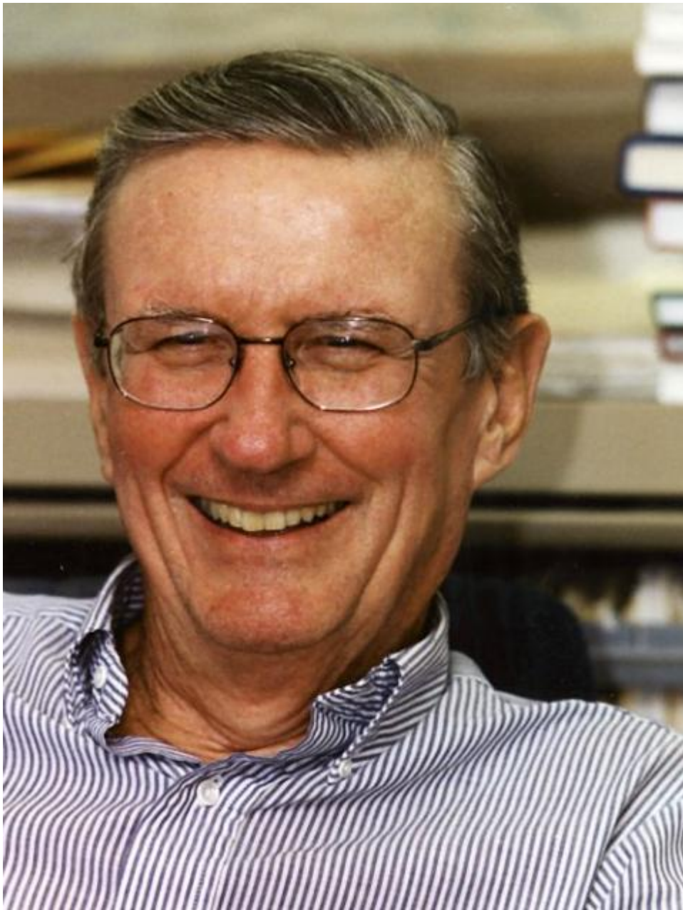
Fr. Charles Curran

Several months after the meeting, Curran received a letter from the congregation, stating that he was "not suitable nor eligible to teach Catholic theology." After several years of academic wandering, Curran was offered a tenured position at Southern Methodist University in 1991, where he remains Elizabeth Scurlock University Professor of Human Values.