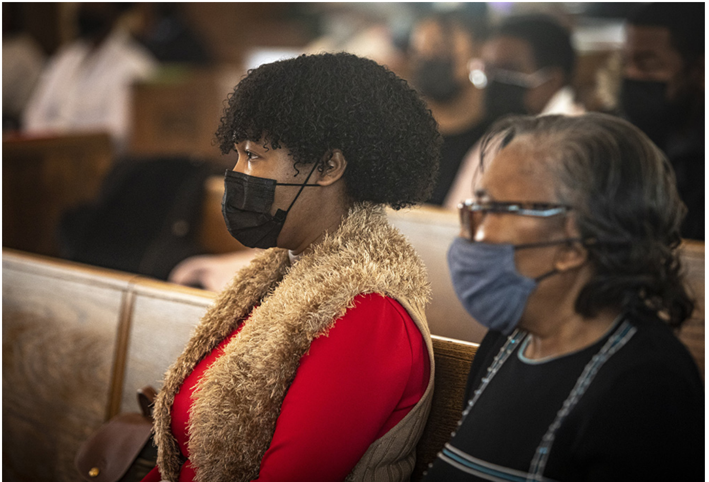
Parishioners attend Mass at St. Barbara Catholic Church Feb. 6, 2022, in Philadelphia.