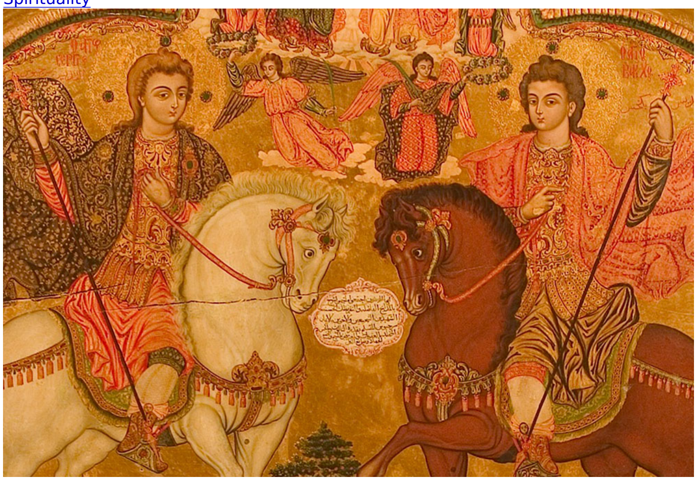
An icon of Sts. Sergius and Bacchus at Mar Sarkis monastery in Maaloula, Syria