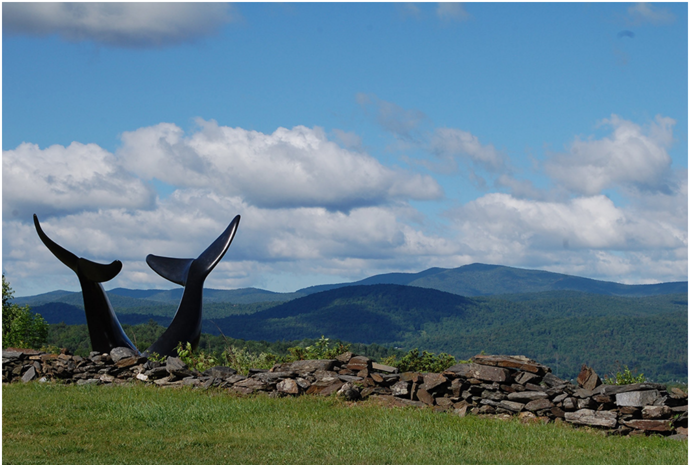
An art installation, Whale Dance, is seen overlooking Randolph, Vermont, and the Green Mountains June 16, 2021.

But an eye toward sustainable practices didn't end with construction. In spring 2017, an intergenerational group of women initiated "green kitchen guidelines" for the hall's industrial kitchen. Groups using the hall space are now required to use the kitchen's reusable plateware and utensils, or provide their own disposable, but compostable products. Plastic-foam cups, paper plates and other non-compostable or recyclable products are barred. Separate bins for composting, recycling and trash are positioned throughout the hall.