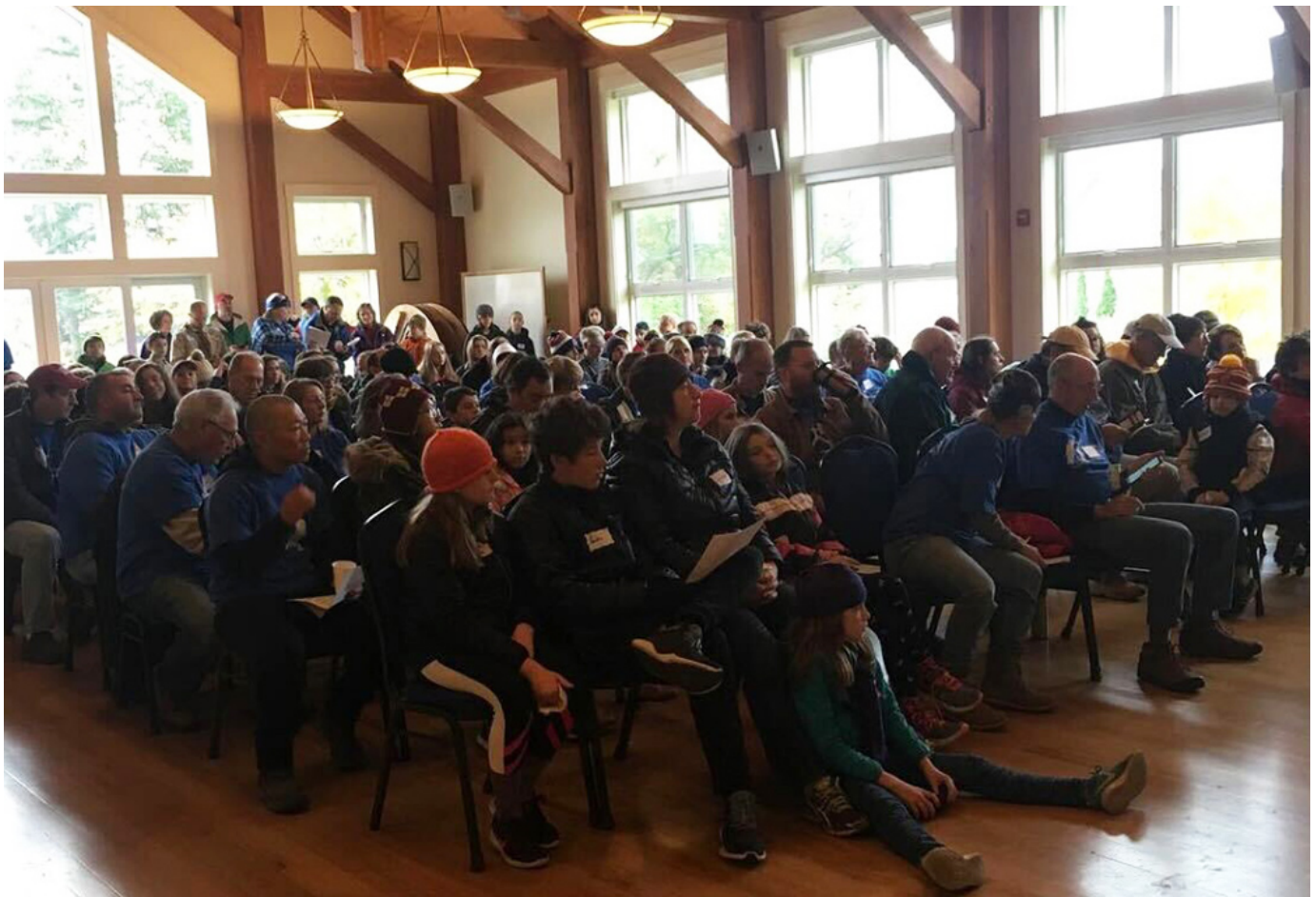
Parishioners of Holy Family-St. Lawrence Parish in Essex Junction, Vermont, gather in the parish hall for Serve Your Neighbor Day in October 2018.

"What are the resources that we have to put at the disposition of that mission?" he asked. Responding, "In this case, one of them was this building as a resource."