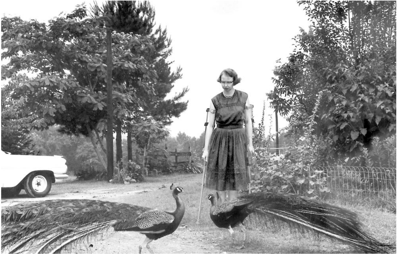
The writer Flannery O'Connor is seen in this 1962 photo.