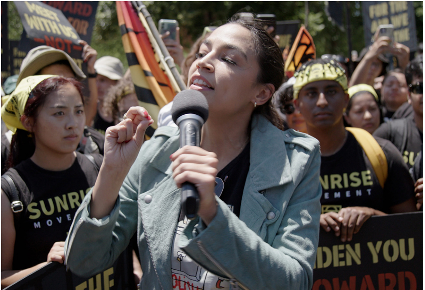
Rep. Alexandria Ocasio-Cortez in "To The End"

The second, far more terrifying realization is that the heroes did warn us and continue to do so, but we have chosen not to listen. Although women aren't prominently mentioned in Scripture, compared to men, they play a key role in the spreading of the word. After all, Jesus first appeared to "Mary Magdalene and the other Mary" on the day of his resurrection. "Go quickly, and tell his disciples," they were asked.