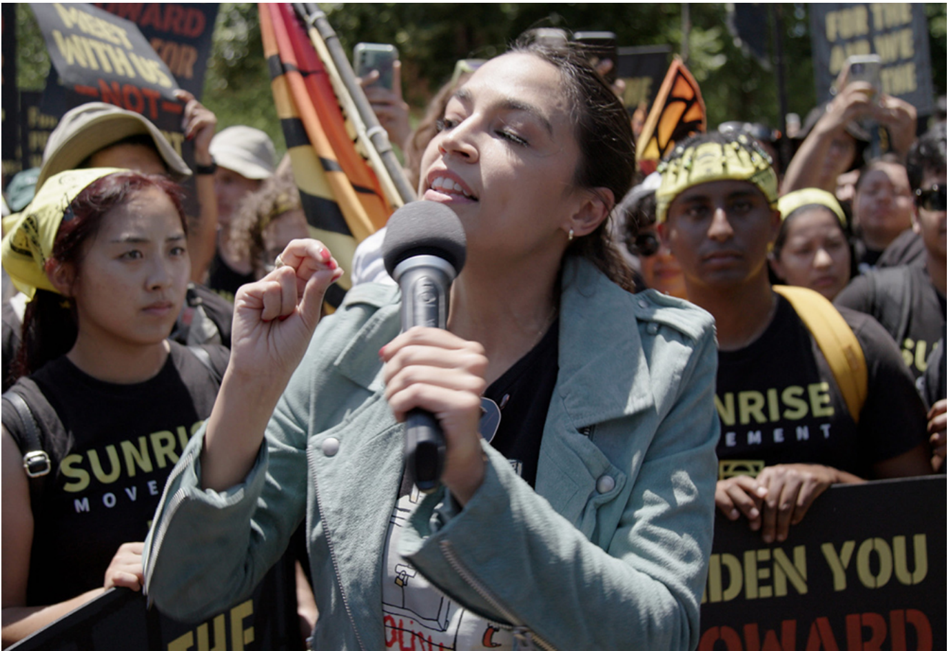
Rep. Alexandria Ocasio-Cortez in "To The End"

The second, far more terrifying realization is that the heroes did warn us and continue to do so, but we have chosen not to listen. Although women aren't prominently mentioned in Scripture, compared to men, they play a key role in the spreading of the word. After all, Jesus first appeared to "Mary Magdalene and the other Mary" on the day of his resurrection. "Go quickly, and tell his disciples," they were asked.