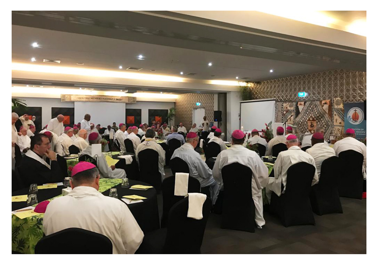
Bishops from Oceania gather Feb. 5-10 in Suva, Fiji. (Susan Pascoe)

Today, those cries are legion: Rapidly rising sea levels have <u>triggered</u> a wave of climate refugees seeking new homelands due to a number of small pacific islands becoming uninhabitable. An increase in cyclones has <u>wreaked</u> havoc on the region's economies and led to tremendous loss of lives and culture, and climate-induced migration has <u>threatened</u> new conflicts on land and at sea.