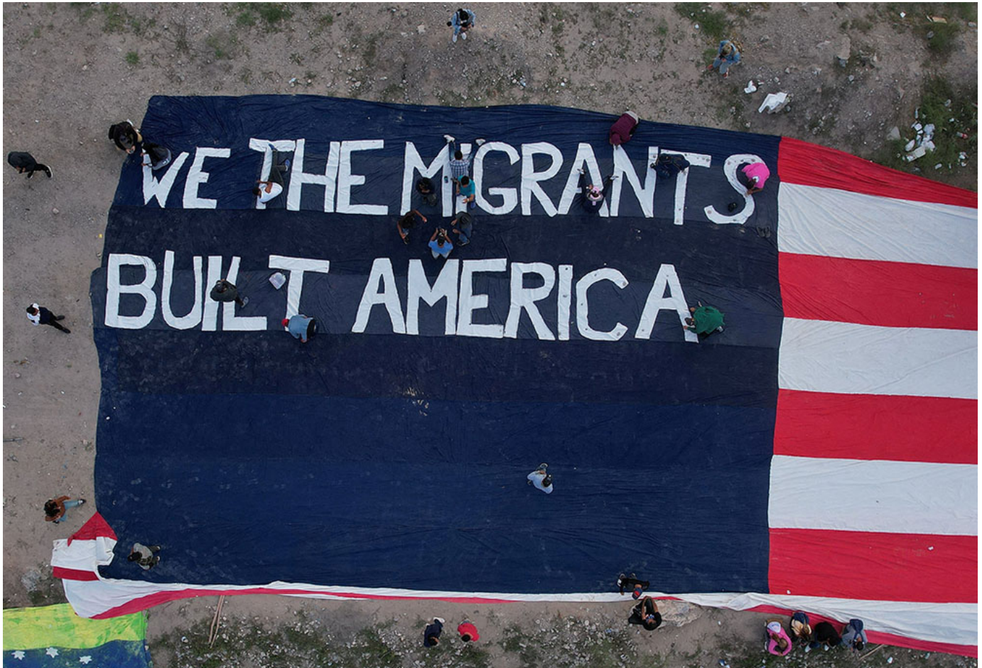
Migrants at a camp near the banks of the Rio Bravo in Ciudad Juárez, Mexico, make a large banner in the likeness of the U.S. flag Oct. 30, 2022.