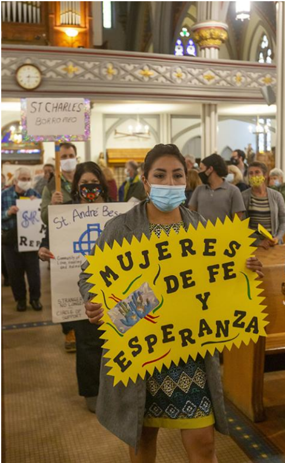
Advocates for immigrants process into Mass at Holy Trinity Catholic Church in Detroit Sept. 22, 2021.