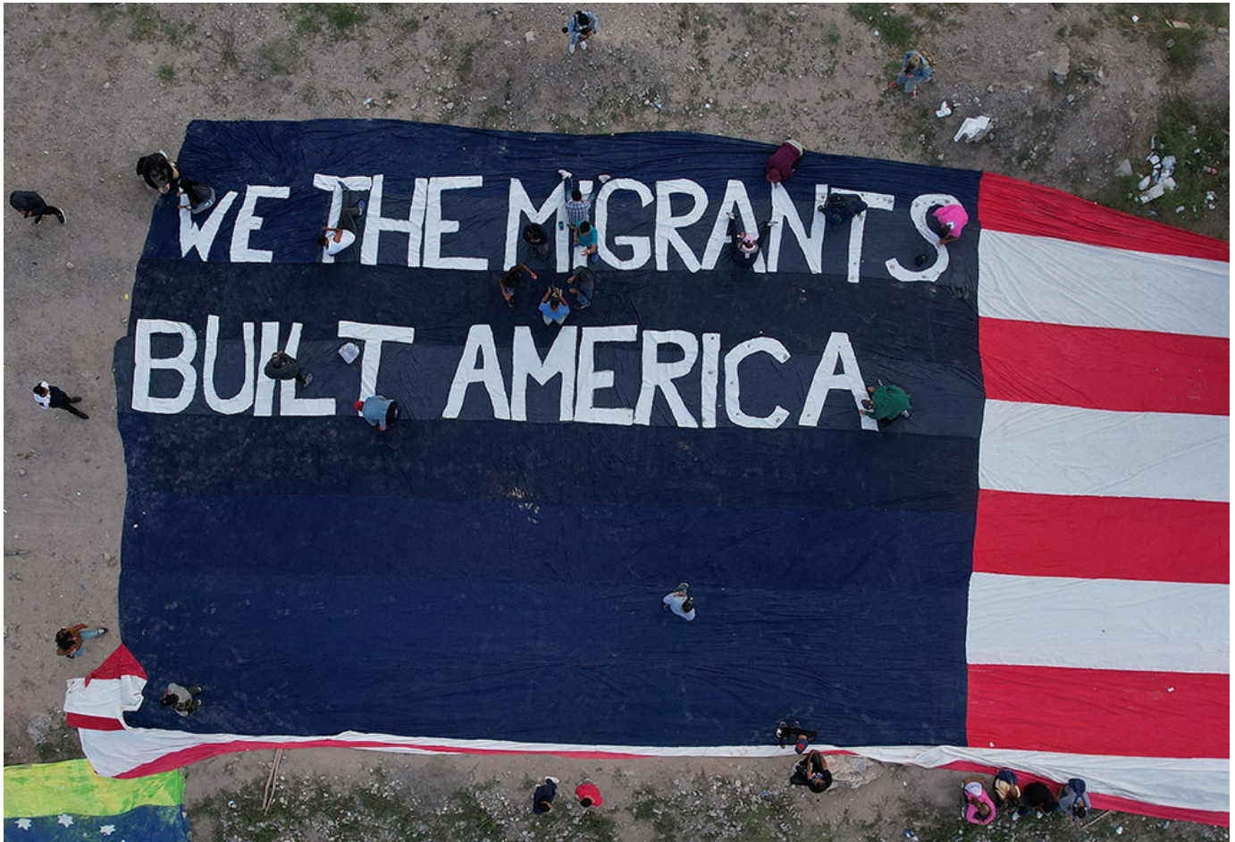
Migrants at a camp near the banks of the Rio Bravo in Ciudad Juárez, Mexico, make a large banner in the likeness of the U.S. flag Oct. 30, 2022.